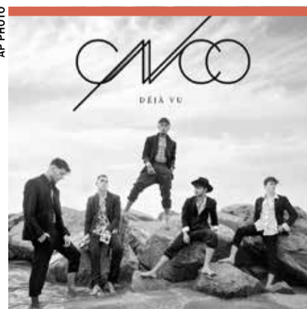
CNCO, “Déjà Vu” (Sony Music Latin)

The quintet take 13 romance songs that made hearts and ears swoon be-