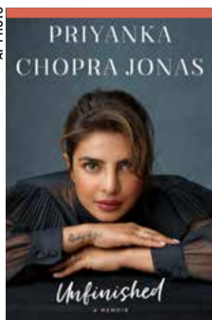
“Unfinished,” by Priyanka Chopra Jonas (Ballantine)

Chopra Jonas never intended to become the internationally renowned entertainer and public figure she is today. Before she was an actor, producer, and UNICEF Goodwill Ambassador, she was the daughter of two doctors, dreaming of becoming an aeronautical engineer. Growing up in India, her life as we know it began accidentally, when her brother convinced a 17-year-old Chopra Jonas to enter the Miss India competition, hoping it would get her out of the house so he could have her bedroom.