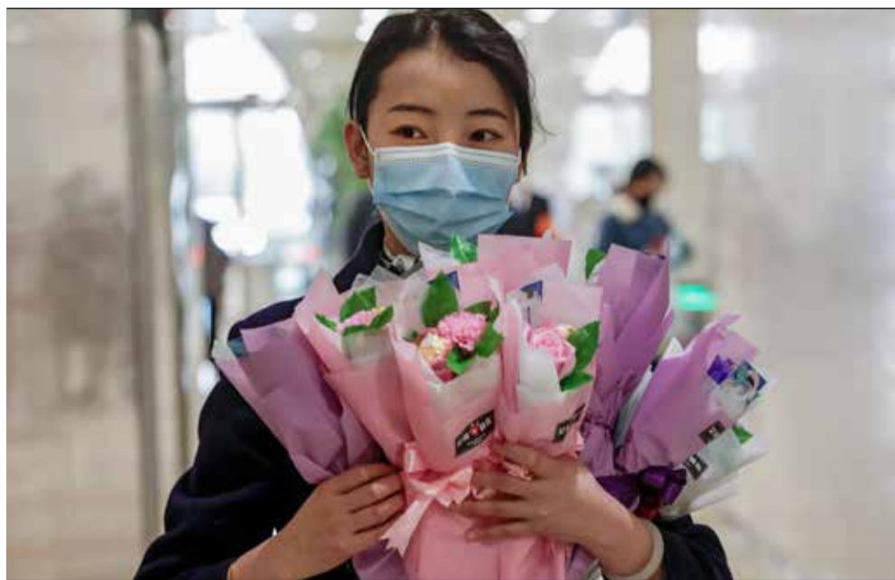
Women's Day. A worker from the LG Towers prepares flowers to hand over to women who enter the office building as part of celebration of International Women's Day in Beijing, yesterday.