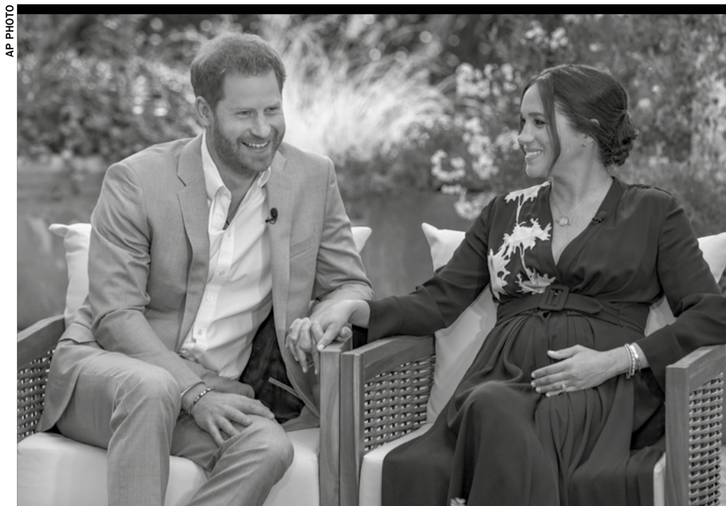
Prince Harry and Meghan, Duchess of Sussex, speaking about expecting their second child during an interview with Oprah Winfrey