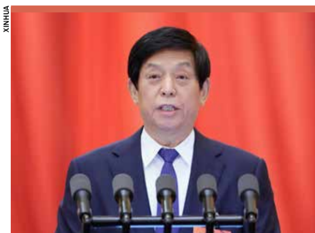
Li Zhanshu, NPC Standing Committee Chairman

While the U.S. and China traded several rounds of sanctions against each other's officials and com-