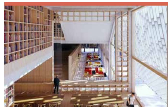
The winning project's interior design of the Macao Central Library

"We need to make spaces be multifunctional and adaptable," Wu said, adding that in terms of inclusivity, the project "welcomes everyone independent of their purpose to visit it. It appeals to both a child, a scholar or a researcher."