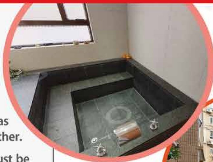
◀ Walk-in Bathing Area

This apartment is an entertainers dream, it must be viewed to be fully appreciated in its current form or as the new owners blank canvass.