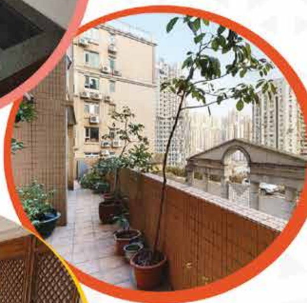
Outdoor Terraces ▶