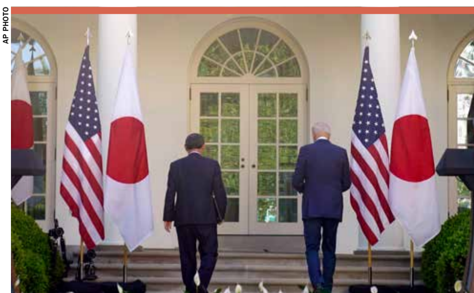
President Joe Biden and Japanese Prime Minister Yoshihide Suga leave after a news conference in the Rose Garden of the White House, Friday

Japan, long cautious in managing relations with its neighbor, has beco-