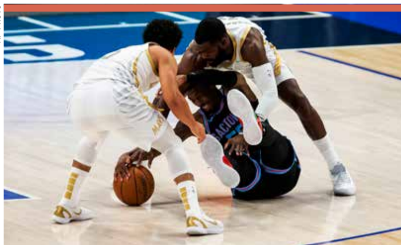
Sacramento Kings guard Delon Wright (center) Dallas Mavericks Jalen Brunson (left) and forward Tim Hardaway Jr.

With Marvin Bagley III missing his 18th straight game (broken hand) and Richaun Holmes his third straight (hamstring strain), 31-year-old Hassan Whiteside, the team's oldest player, made his second start of the season at cen-