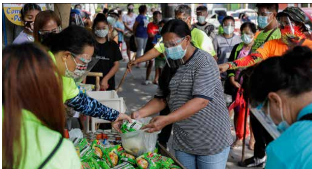
Community Pantry. A woman receives free food at a makeshift stall called "Community Pantry" beside a road in Quezon city yesterday. Donated food and other essential items from residents or volunteers are placed on makeshift stalls for people who need it as many have lost jobs in Covid year.