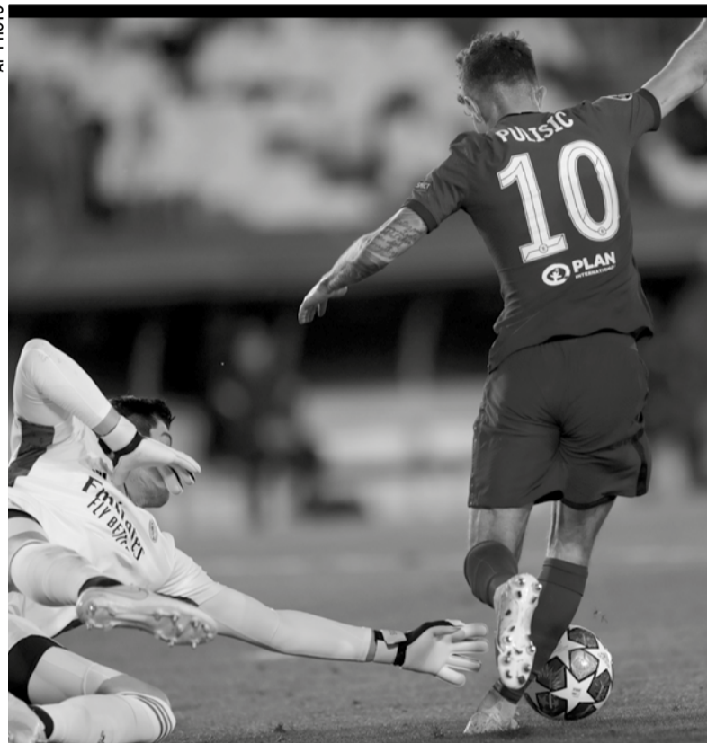
Chelsea's Christian Pulisic avoids Real Madrid's goalkeeper Thibaut Courtois to score the opening goal

and had chances to add to its lead after Pulisic opened the scoring with a nice finish in the 14th minute off a high pass by Antonio Rudiger inside the area. Pulisic calmly got past goalkeeper Thibaut Courtois before hitting the net past the Madrid defenders trying to block his shot at the goal line.