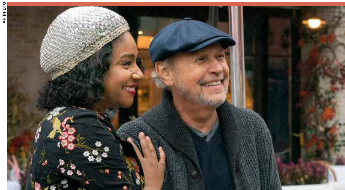
Tiffany Haddish (left) and Billy Crystal in a scene from “Here Today”