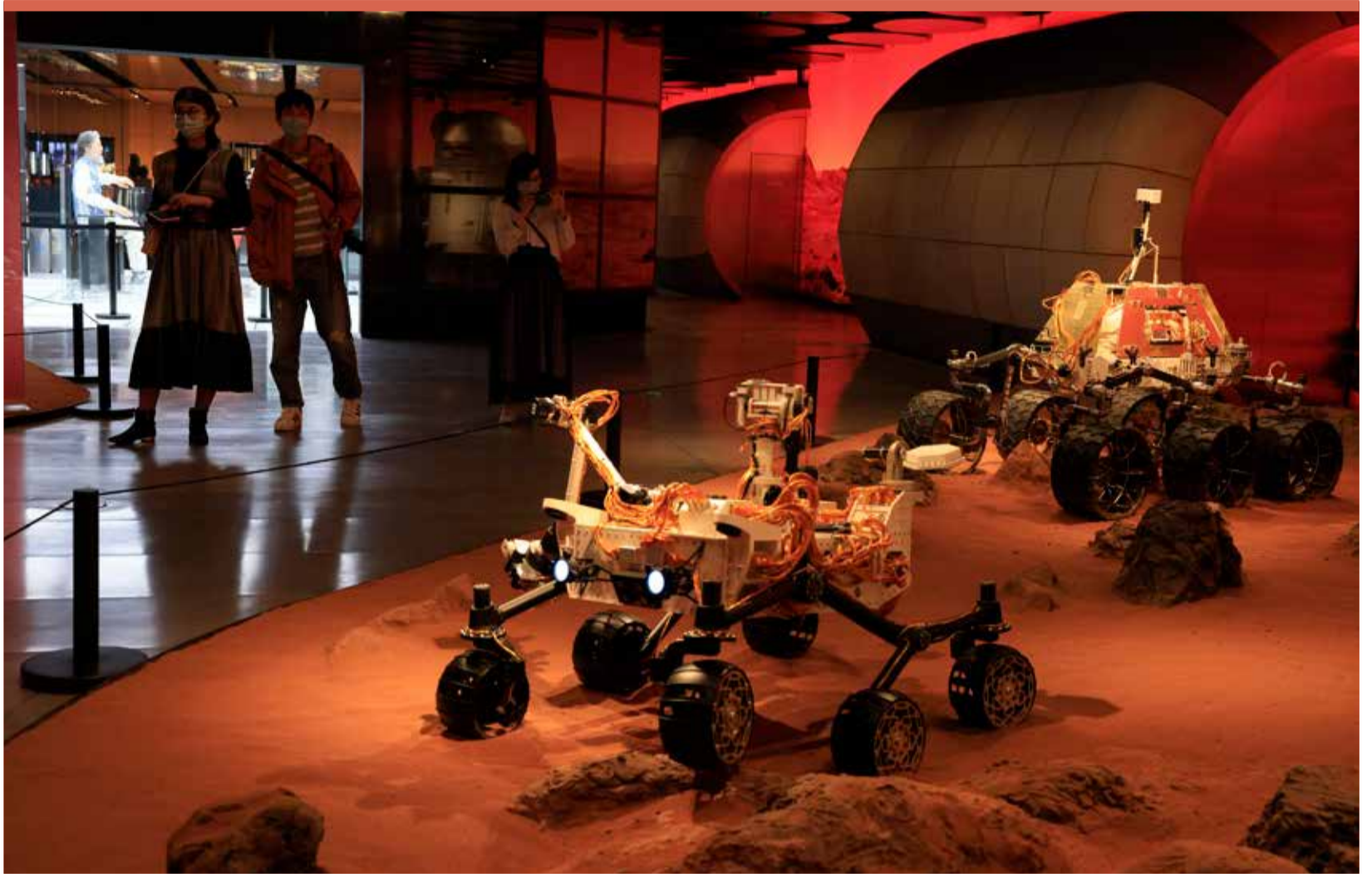
Visitors pass by an exhibition depicting rovers on Mars in Beijing, Friday