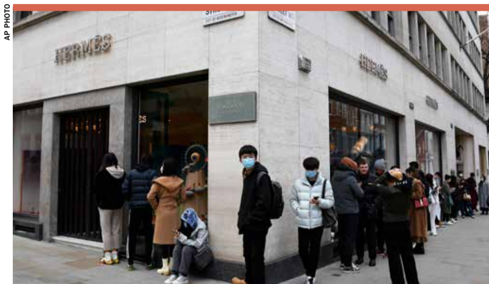
Hermes store in Mayfair in London

In its most optimistic outlook, Bain forecasts a full recovery and even growth to as much as 295 billion euros ($358 billion)