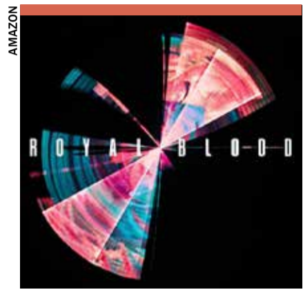
Royal Blood, "Typhoons" (Warner Records)

Singer, keyboardist and bassist Mike Kerr puts the bass front and center, often fuzzed-out and doing a solo. Drummer Ben Thatcher attacks his kit like a ja-