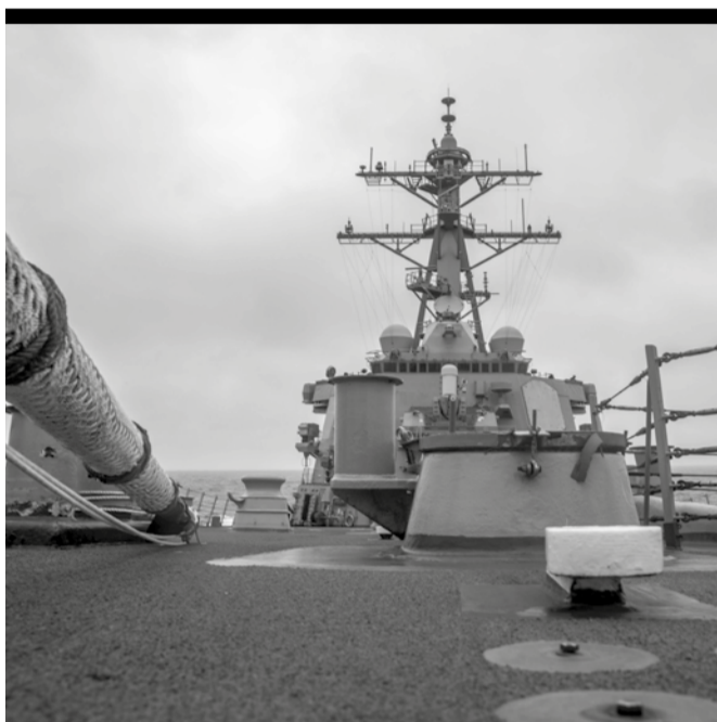
U.S. Arleigh Burke-class guided-missile destroyer USS Curtis Wilbur conducts routine operations in the Taiwan Strait this week

China accused the U.S. of increasing regional security risks, "misunderstandings, misjudgments, and accidents at sea." It called the ship's maneuvers "unprofessional and irresponsible," saying Chinese forces were determined to defend the country's sovereign claims while maintaining peace and stability in the South China Sea.