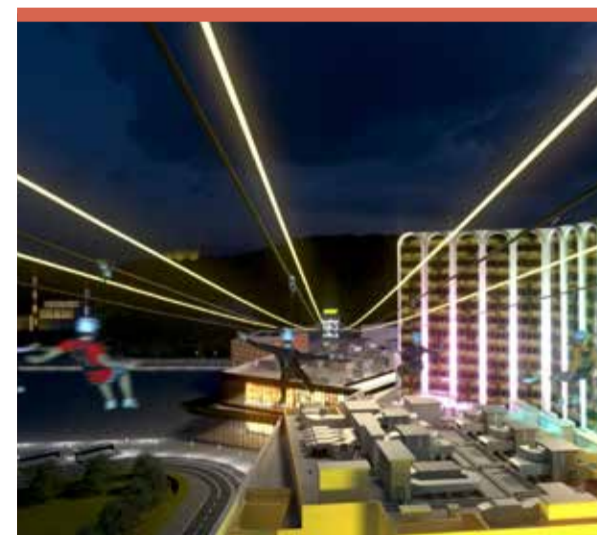
Computerized impression of ZIPCITY