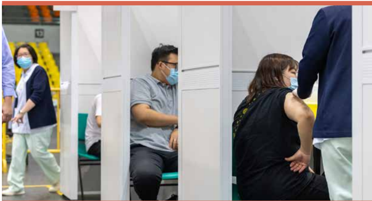
When asked by the media about the current supply of mRNA vaccines, Tai again gave

Following the extended availability of vaccination services, the government anticipates the current 15 stations can offer a total of 8,200 doses every day. This number can be further lifted to 10,000 after the Mong-Ha Sports Centre site comes into service.