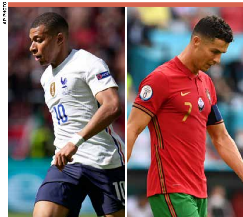
France's Kylian Mbappe (left) and Portugal's Cristiano Ronaldo

After Antoine Griezmann backed him, so did left back Lucas Digne.