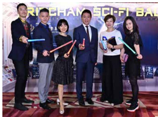
The Force is strong with ICBC, Ruby Sponsor