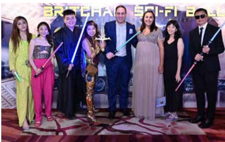
Ruby Sponsor, Jardine Matheson show their strength & team spirit