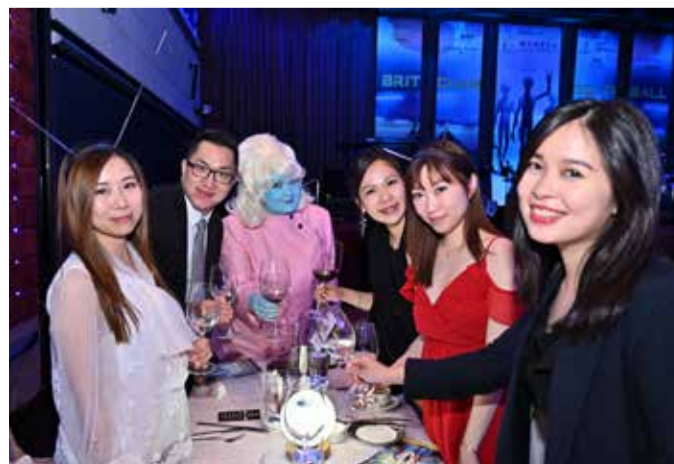
Cheers & congratulations to Ruby Sponsor CTM, celebrating their 40th Anniversary