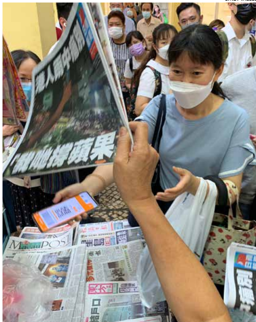
Local residents lined up at a newspaper stand yesterday to grab the last issue of Apple Daily. The newspapers were sold out in several minutes and many queuers failed to obtain a copy.