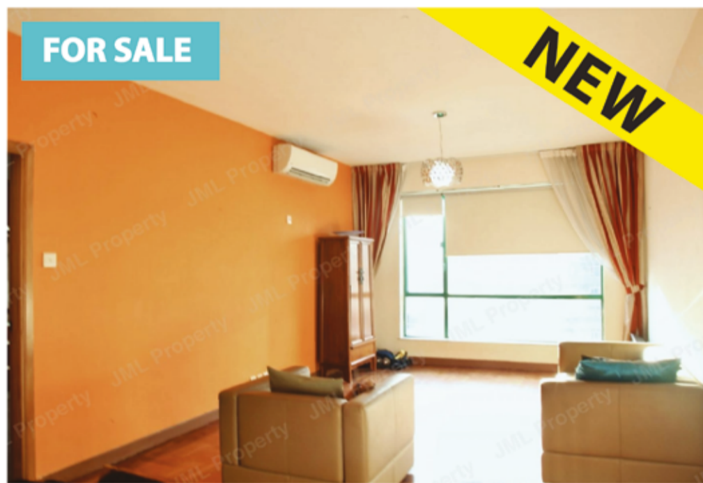
Lakeview Mansion HKD 13,800,000 1,979 ft 2 3 2

This generous size 3 bedroom apartment is located in one of the most popular locations in Macau close to Grand Lisboa Hotel. The apartment includes 2 baths, 3 individual balconies and a spacious kitchen. The unit also has ample natural light, and the master bedroom has an en suite bathroom with a built-in wardrobe.