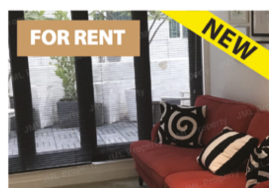
Soi Cheung HKD 9,900/mth 650 ft 2 1 1