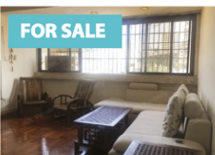
Traditional, Macau HKD 2,680,000 788 ft 2 2 1