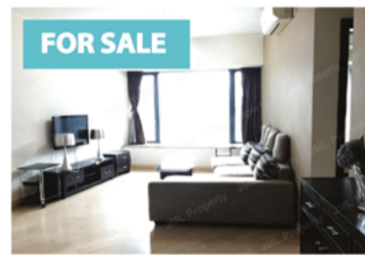
Lakeview Tower HKD 11,000,000 1,344 ft 2 3 2