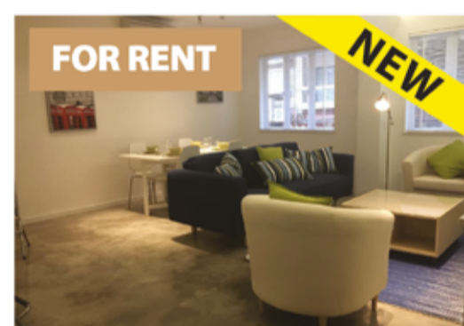
Taipa Village HKD 10,900/mth 740 ft 2 1 1