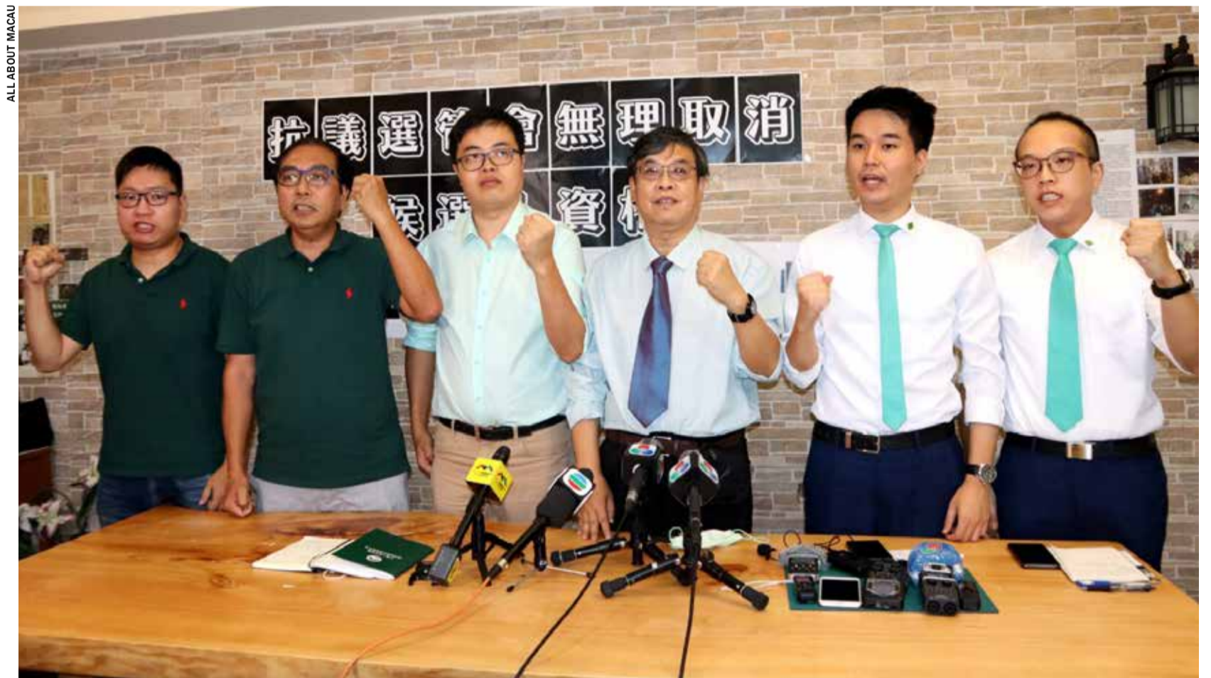
ALL ABOUT MACAU

The electoral committee disqualified six candidate lists from the elections for 'not upholding the Basic Law.' In turn, the candidates will appeal the decision P3