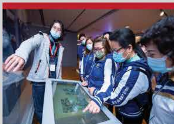
Team members visited the Base of the Education of Love for the Motherland and for Macau for Young People to review the history and development of China and Macau.