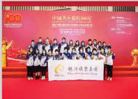
Team members visited a large-scale photo exhibition theming the celebration of CPC's anniversary to learn about the party's history and achievements in the past century.