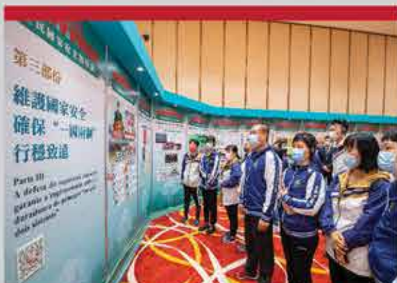
Team members visited the National Security Education Exhibition.