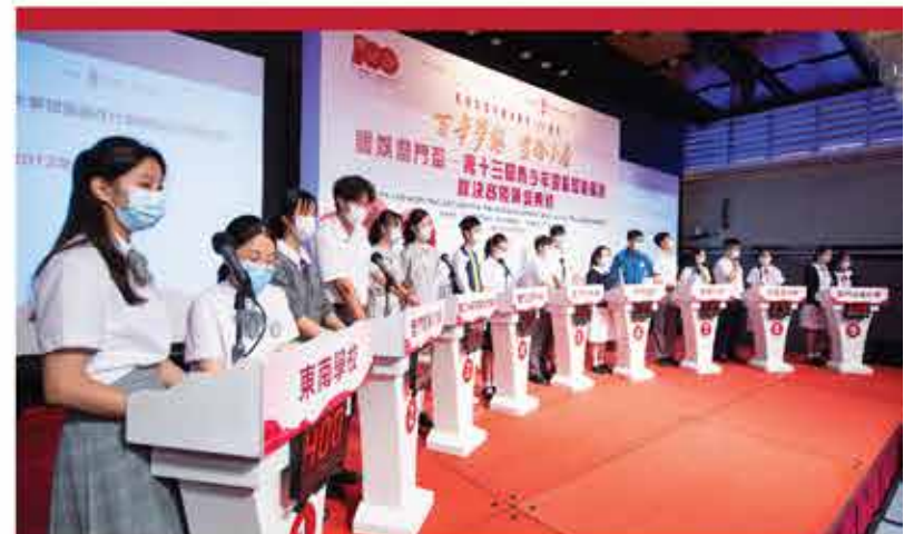
The Youth National Education Competition has attracted upwards of 100,000 students from local high schools and higher education institutions since 2009.