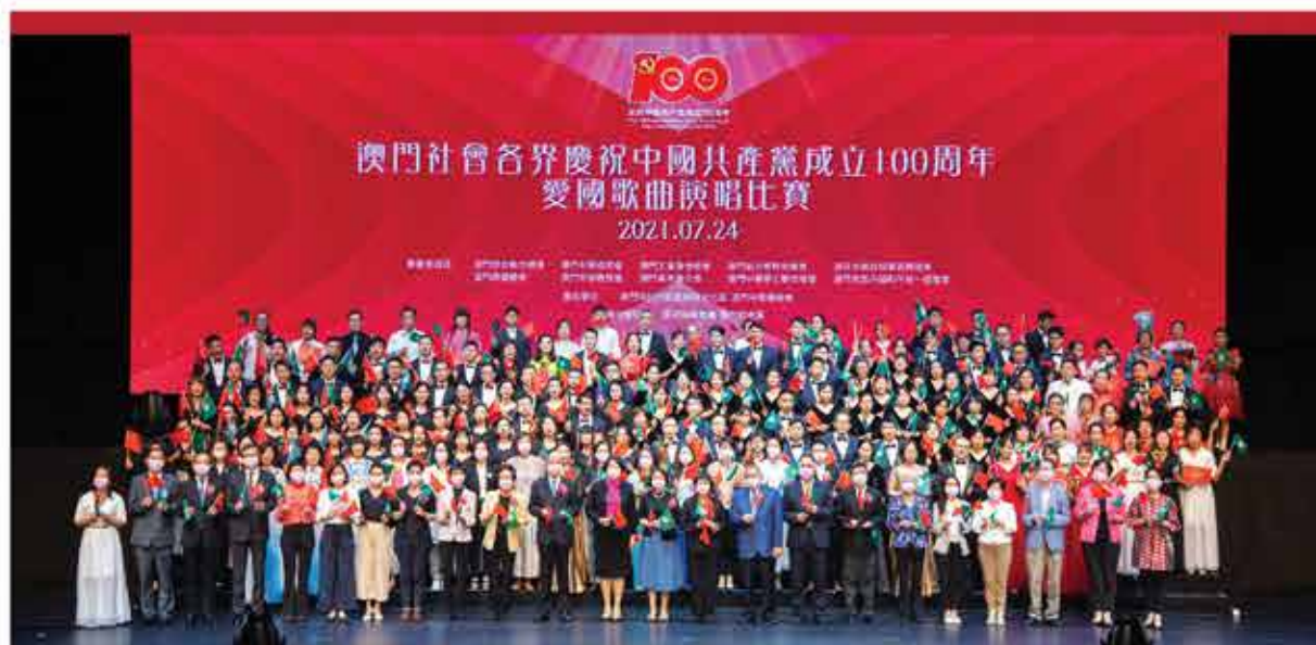
GEG provided venue sponsorship for a patriotic song singing contest co-organized by 10 different local social service associations.

community to celebrate the CPC's centenary. Recently, GEG provided venue sponsorship for a patriotic song singing contest co-organized by 10 different local social service associations. The contest was successfully concluded at the Broadway Theater of Broadway Macau. By providing a professional stage, equipment support and venue, GEG supported the community in expressing their love to the CPC and the country through singing. As well, GEG sponsored the Grand Thought Think Tank and other associations on hosting a seminar on CPC's history at Banyan Tree Macau in Galaxy Macau by providing venue