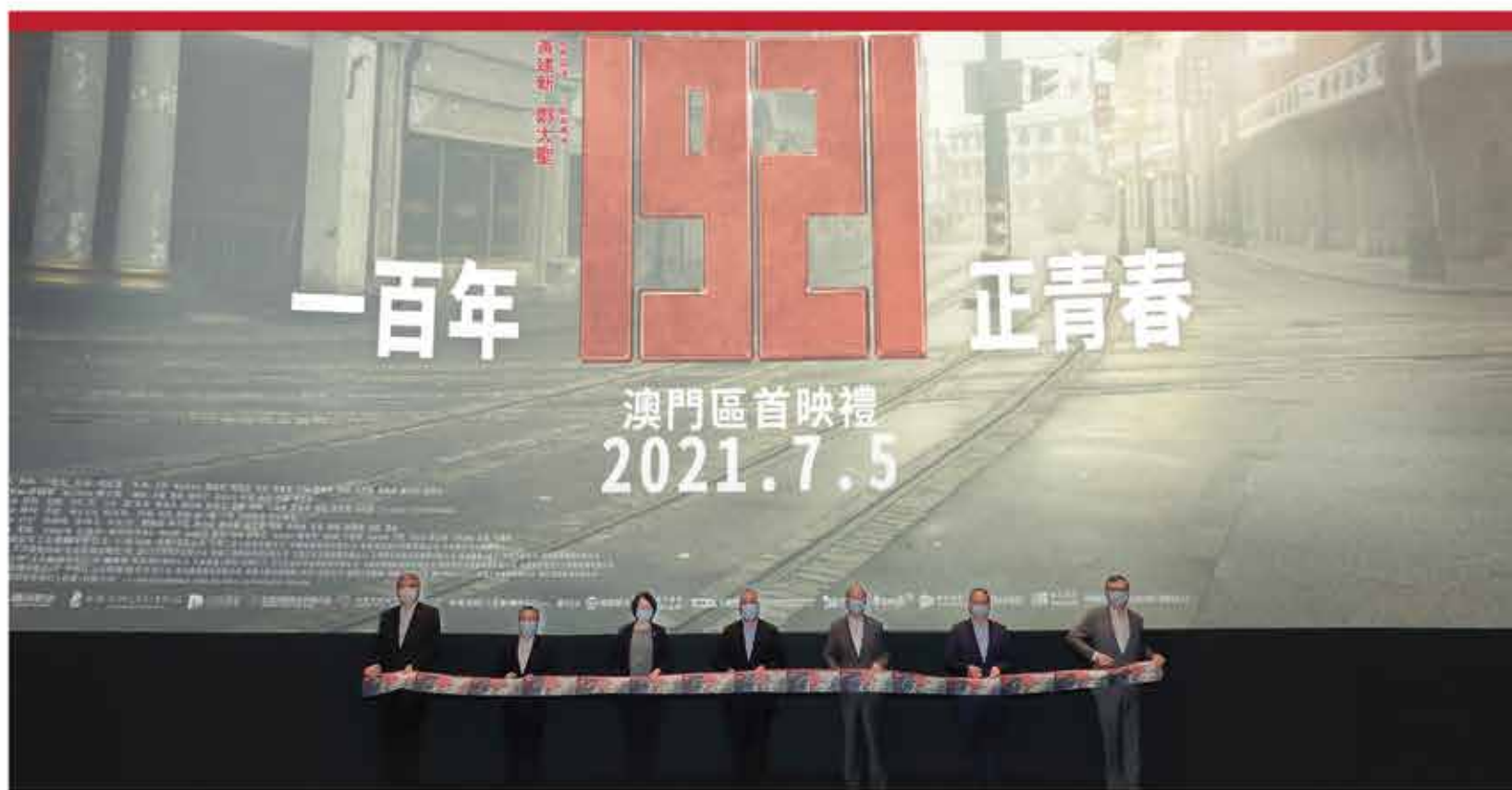
"1921" Premiere Ceremony at Galaxy Cinemas