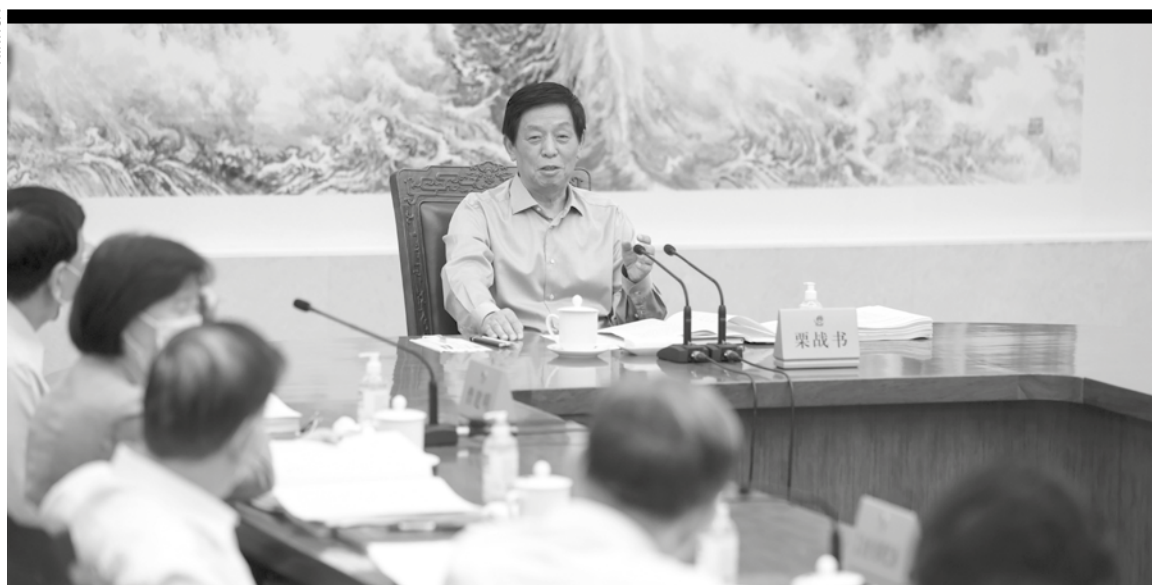
Li Zhanshu, chairman of the NPC Standing Committee, presides over a meeting, Tuesday

The purpose of formulating the law is to counter unilateral sanctions imposed against China by foreign countries, safeguard national sovereignty, security and