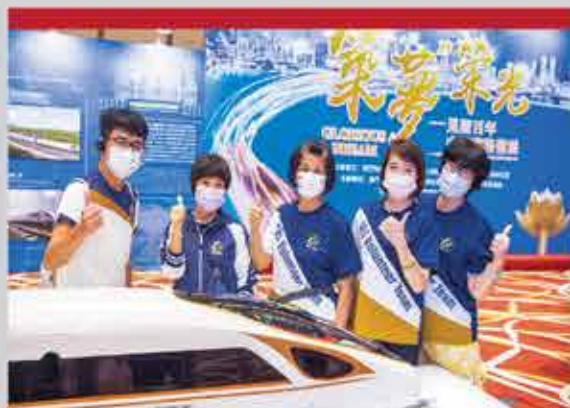
Team members gained a deeper understanding of the world-leading railway construction technology of China in "The Glory of 'Building Dreams' - Witnessing a Century of Chinese Railway Development Exhibition".