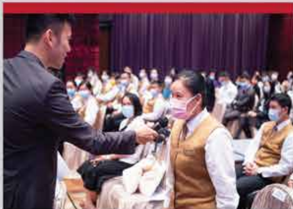
More than 120 team members participated in the Youth National Education Competition to consolidate the knowledge of the country's history and conditions.

Valuing the importance of national education, GEG also organized a variety of activities for its team members, including visits to different exhibitions aimed to enrich their understanding of the country and promote national identity and patriotism.