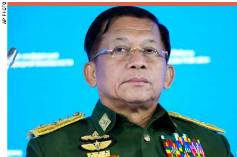
Commander-in-Chief of Myanmar's armed forces, Senior General Min Aung Hlaing

"It's moving us further away from what we have been calling for, member states have been calling for, which is a return to democratic rule, a release of all [...]