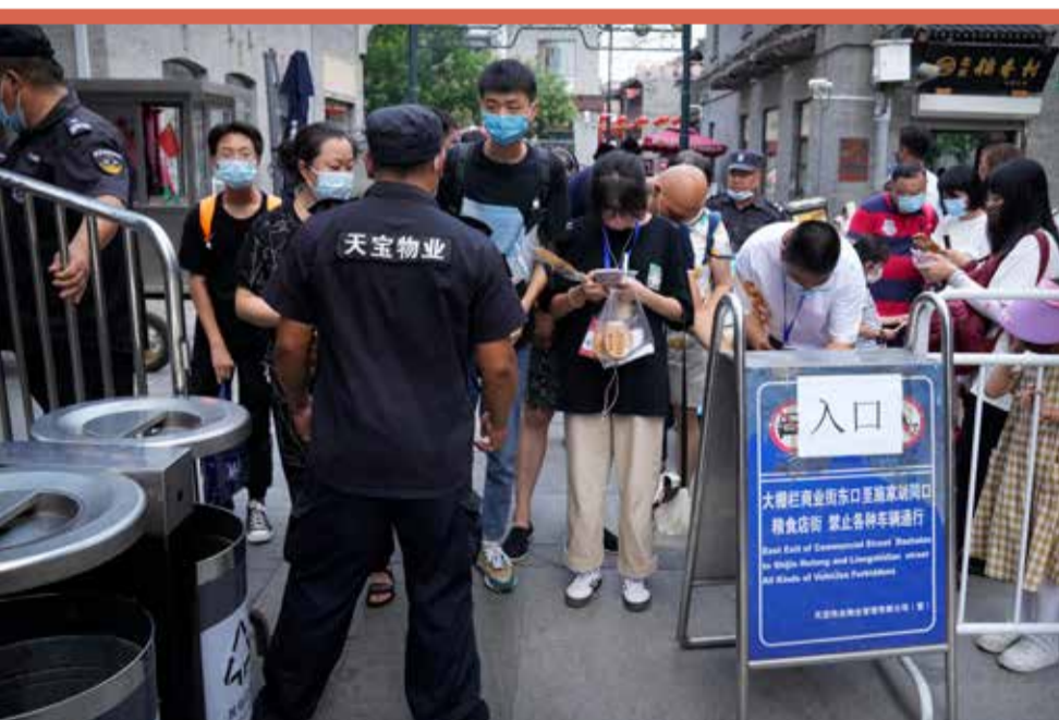
People scan health check codes with their smartphones to show to a security guard at a tourist shopping street in Beijing