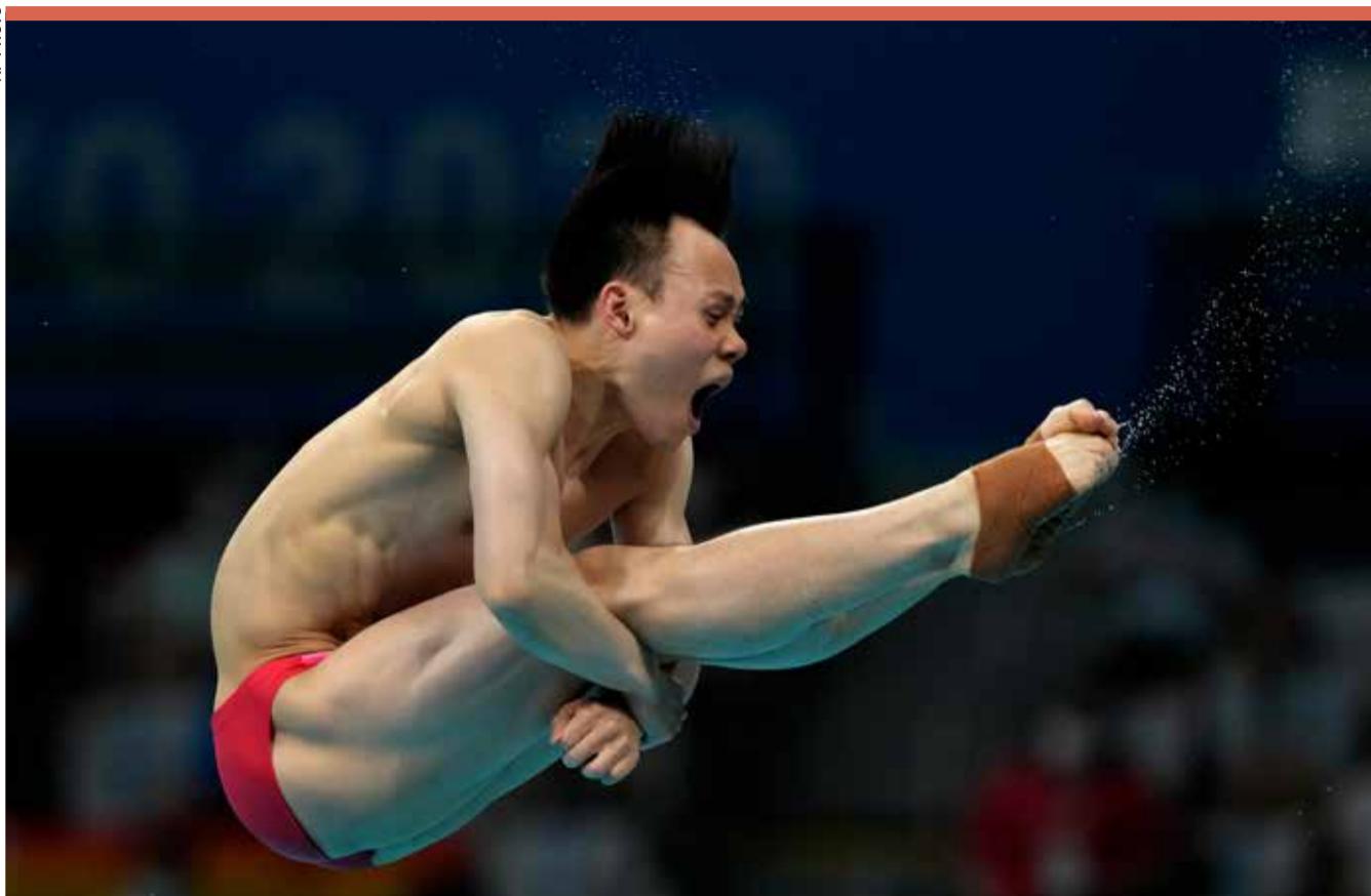
Xie Siyi of China claims gold in men's diving 3m springboard