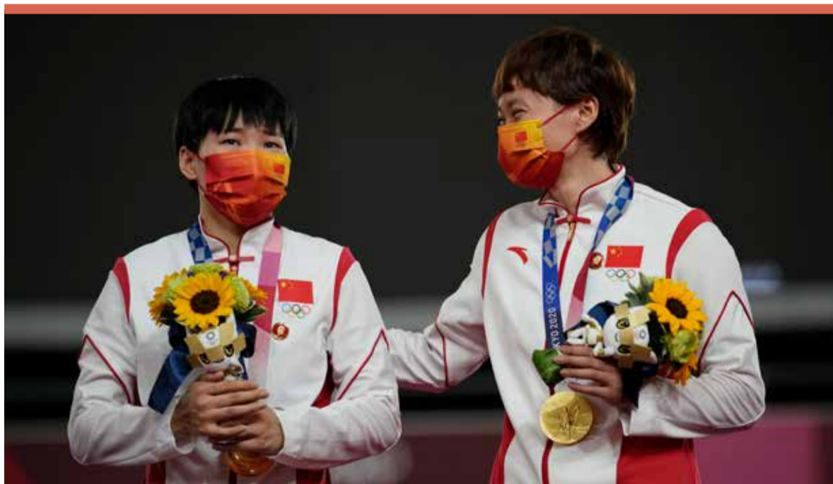
Shanju Bao (left) and Tianshi Zhong, of China, celebrate Monday their gold medals wearing Mao Zedong pins