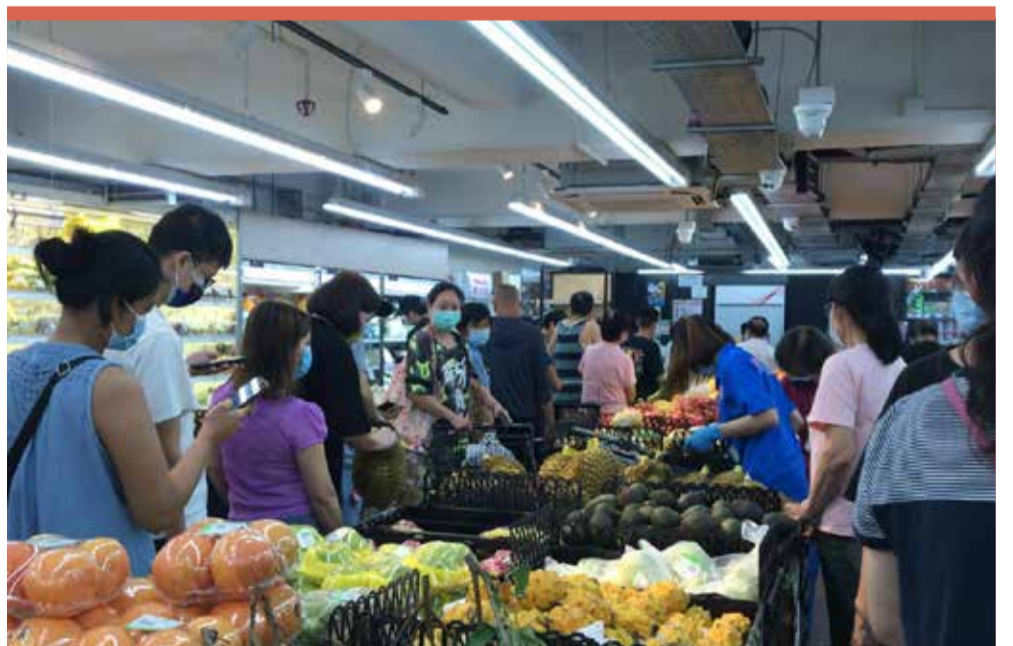
Residents flock to supermarkets following the government's announcement of new Covid cases in Macau

The signing ceremony was also attended by an official from Changzhou, who reaffirmed his commitment to better promote Tianning's quality fresh produce to Macau's residents.