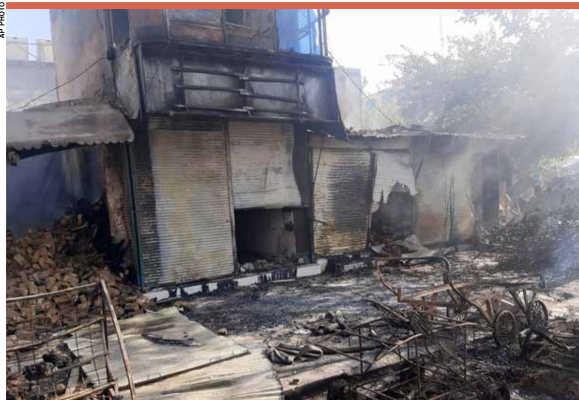
Smoke rises from damaged shops after fighting between Taliban and Afghan security forces in Kunduz city

vince, the city of Shibirghan, the capital of northern Zawzjan province, and Taleqan, the capital of another northern province with the same name.