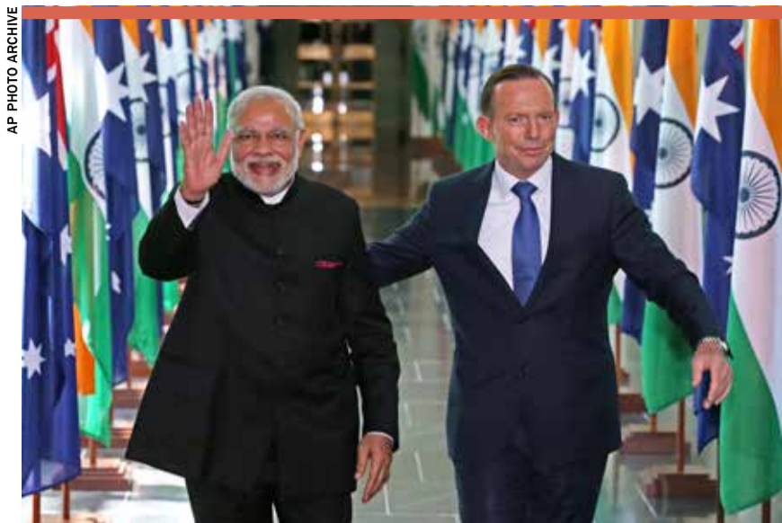
India's Prime Minister Narendra Modi (left) and former Australian Prime Minister Tony Abbott