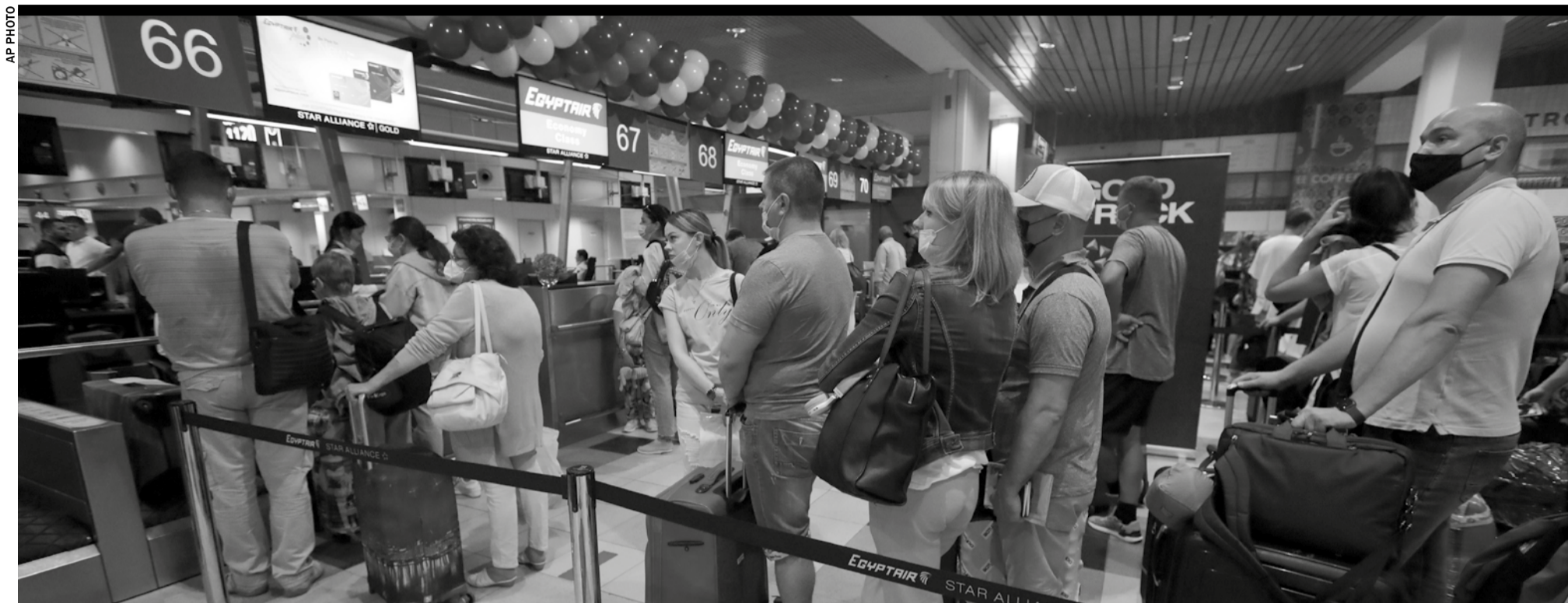
Russian tourists gather at the Egyptair check-in desk at the Domodedovo International Airport outside Moscow yesterday