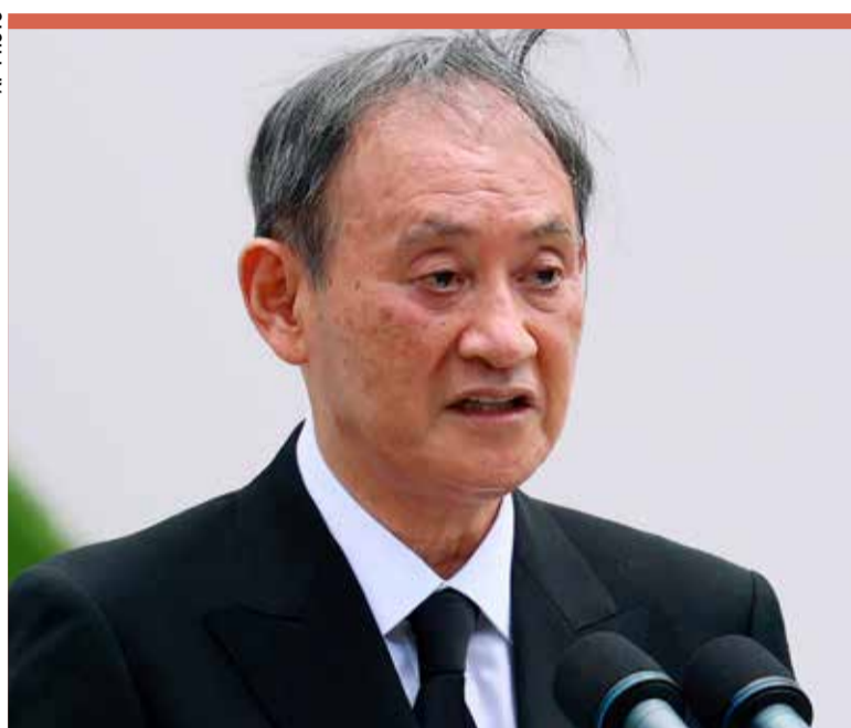
Japan's Prime Minister Yoshihide Suga

But the Games were a testament to perseverance, and as Suga noted in praising Japa-