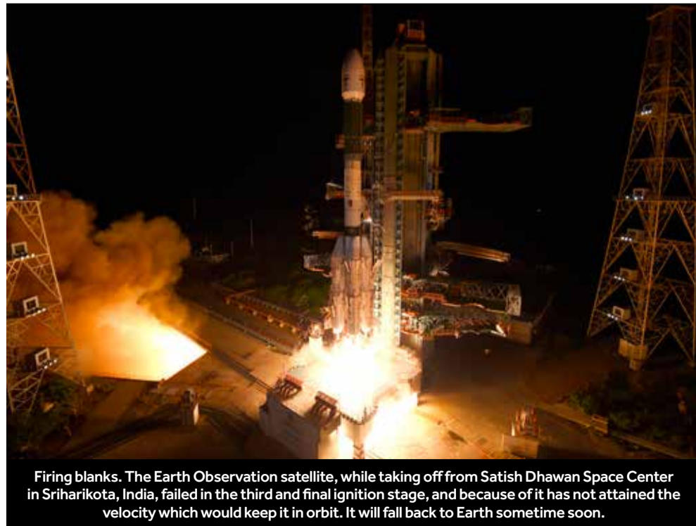
Firing blanks. The Earth Observation satellite, while taking off from Satish Dhawan Space Center in Sriharikota, India, failed in the third and final ignition stage, and because of it has not attained the velocity which would keep it in orbit. It will fall back to Earth sometime soon.