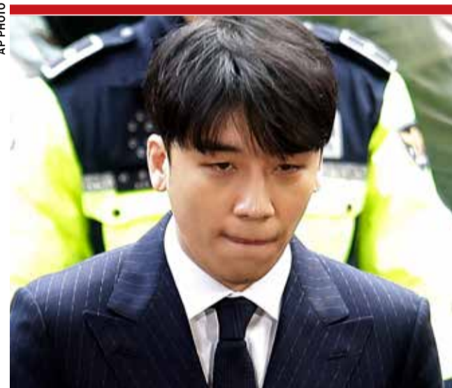
Seungri, a former member of a popular K-pop boy band Big Bang

His case was transferred to a military court after he enlisted in the army in March last year for 21 months of military service, a requirement for most