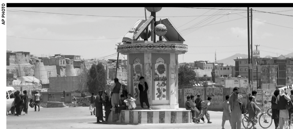
A Taliban flag flies at a square in the city of Ghazni

Afghan security forces and the government have not responded to repeated requests for comment over the days of fighting. President Ashraf Ghani is trying to rally a counteroffensive relying on his country's spe-