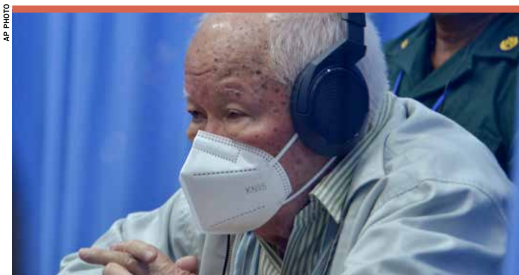
Khieu Samphan, former Khmer Rouge head of state, sits in a courtroom during a hearing at the U.N.-backed war crimes tribunal in Phnom Penh yesterday