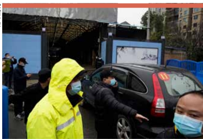
Security personnel clear the way for a convoy of WHO team to enter the Huanan Seafood Market during the field visit in Wuhan, last January

He accused the U.S. of "hyping the lab leak theory" and trying to shift the blame onto China, and implied the coronavirus might be linked to high-level American research labs, suggesting the United States invite