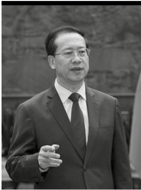
Vice-Foreign Minister Ma Zhaoxu