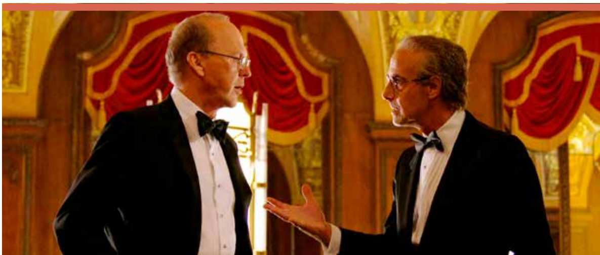
Michael Keaton (left) and Stanley Tucci in a scene from "Worth"