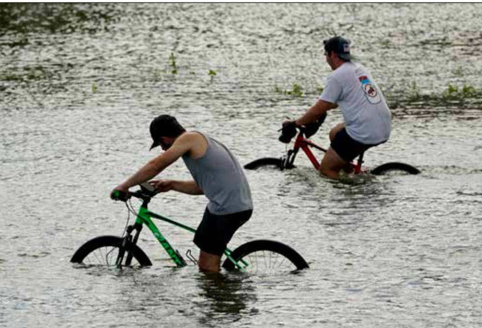
Determination. Cyclists peddle through floodwaters caused by the effects of Hurricane Ida near the New Orleans Marina, earlier this week, in New Orleans.