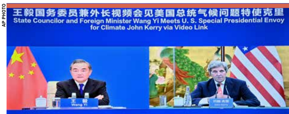
Foreign Minister Wang Yi (left) and U.S. Special Presidential Envoy for Climate John Kerry meet via video link in China