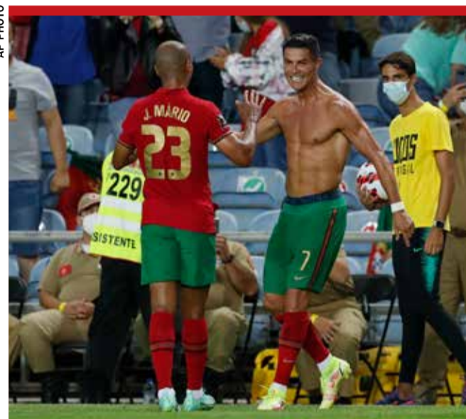
Portugal's Cristiano Ronaldo (right) celebrates after scoring his side's second goal

more than 100 times for their countries are Ronaldo and Daei, who scored 109 goals in 149 games for Iran from 1993-2006 and played for German clubs Bayern Munich and Hertha Berlin.