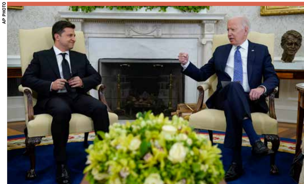
U.S. President Joe Biden meets with Ukrainian President Volodymyr Zelenskyy in the White House's Oval Office