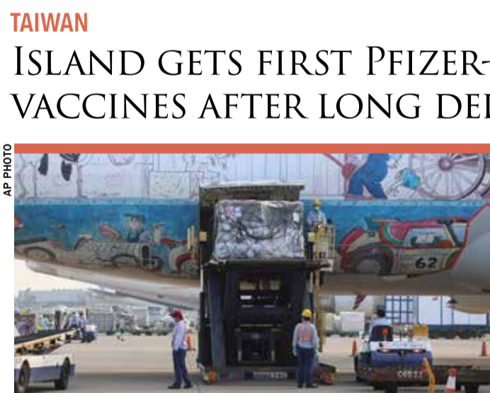
A shipment of Pfizer-BioNTech vaccines from an aircraft at the Taoyuan International Airport yesterday

Even their arrival has been dogged by politics. Local media at first reported Taiwan