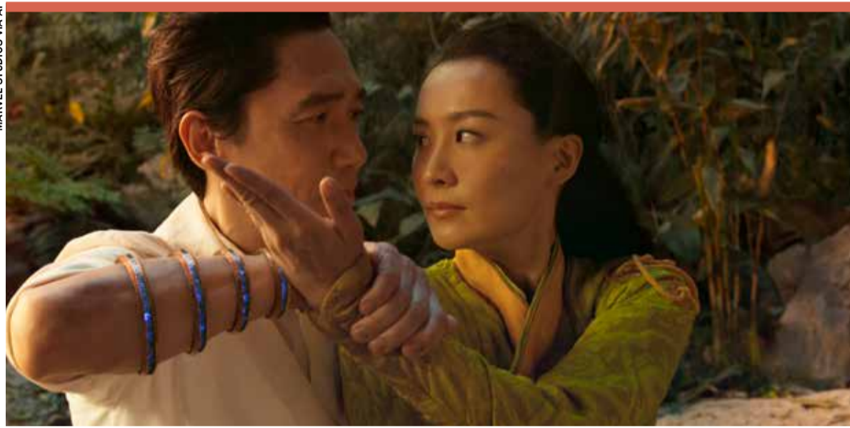
Tony Leung (left) and Fala Chen in a scene from "Shang-Chi and the Legend of the Ten Rings"

universe and in possession of 10 magical rings that give him superhuman powers.