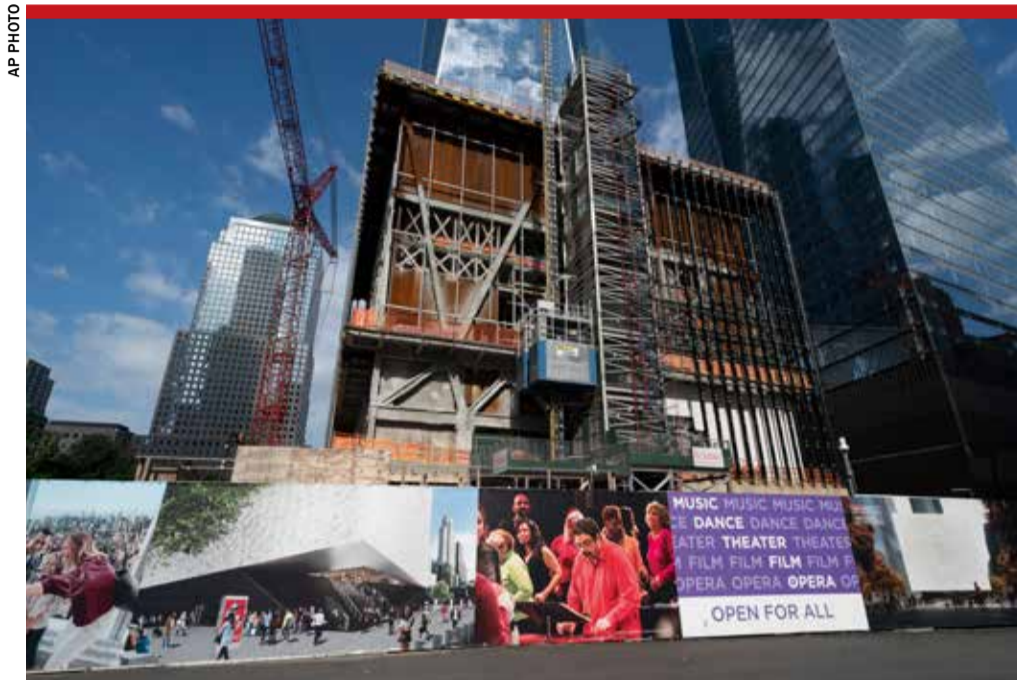
The Ronald O. Perelman Performing Arts Center is under construction

The researchers attributed the data holes to the federal Centers for Medicare and Medicaid Services not requiring nursing homes to report cases and deaths until May 2020, well into the pandemic. The new estimates rely on numbers from states that required fuller reporting.