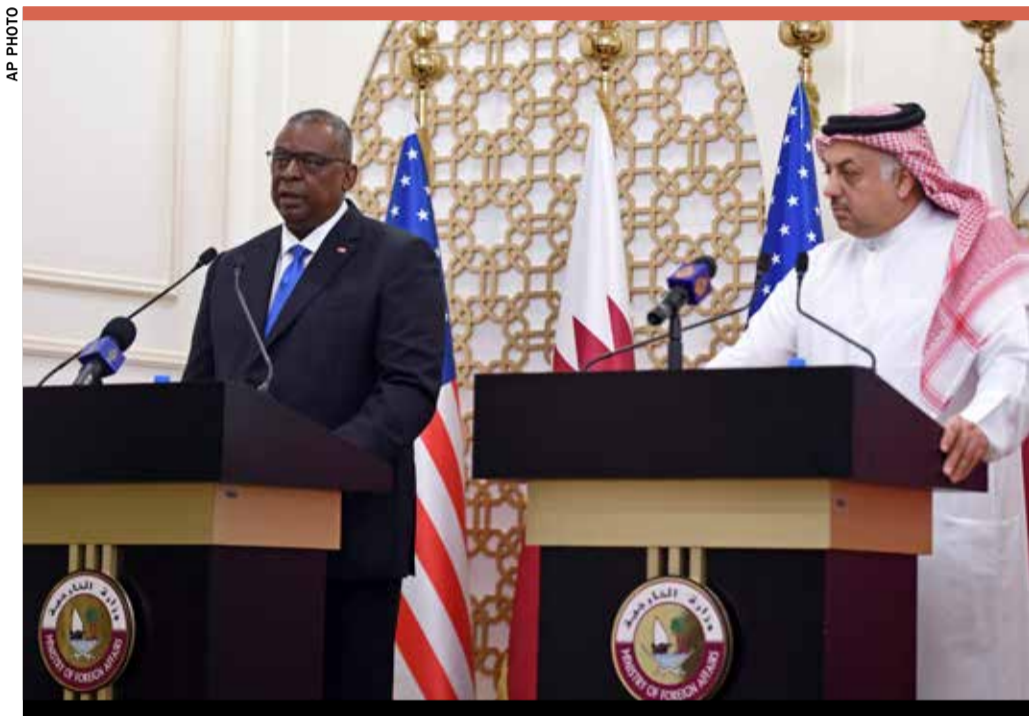
US Secretary of Defense Lloyd Austin (left) and Qatari Defense Minister Khalid Bin Mohammed Al-Attiyah