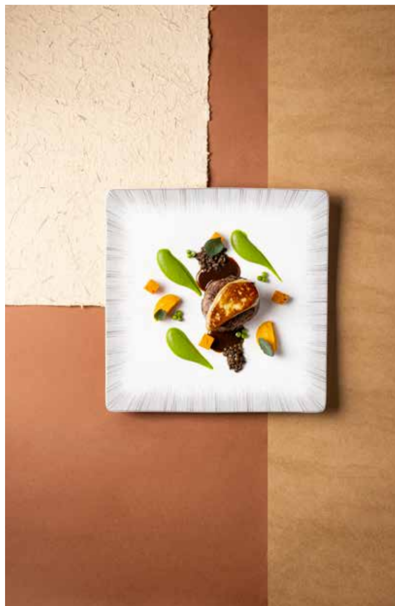
True born beef

For the finale, Glenilen' Yogurt Pannacotta with apricot, peach, wild berry and clotted ice cream features cream from Glenilen Farm. The small dairy farm resting on the banks of the River Ilen in Ireland has been around for generations. The lush hills offer its cows a rich and plentiful supply of nutritious grass which in turn supply the rich tasty milk free of artificial additives or preservatives.