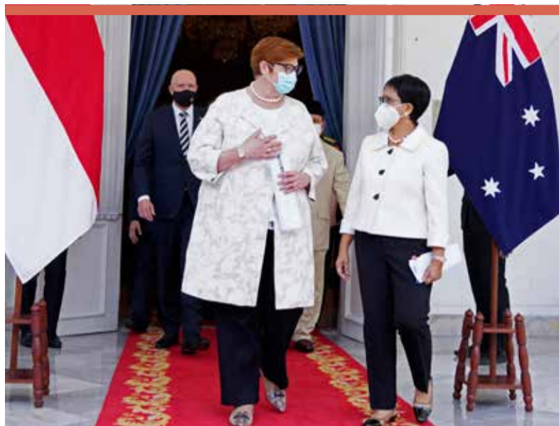
Australian Foreign Minister Marise Payne (second left) and Defense Minister Peter Dutton (rear left) walk with their Indonesian counterpart Retno Marsudi (right) and Prabowo Subianto (rear right)