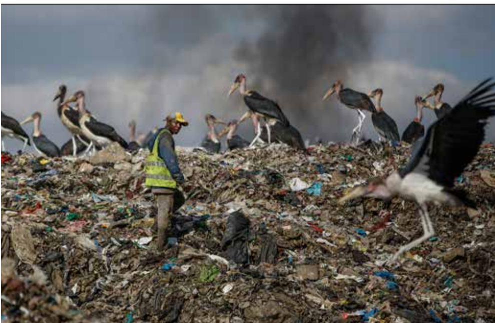
Another man's treasure. A man who scavenges recyclable materials for a living walks past Marabou storks feeding on a mountain of garbage amidst smoke from burning trash at Dandora, the largest garbage dump in the capital Nairobi, Kenya.