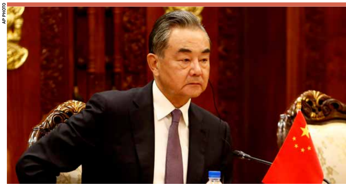
Chinese Foreign Minister Wang Yi listens to his Cambodian counterpart Prak Sokhonn during a meeting in Phnom Penh yesterday

Hun Sen spoke on a live television broadcast in which he praised China for its aid at a handover ceremony for a new 60,000-person capacity stadium built on the