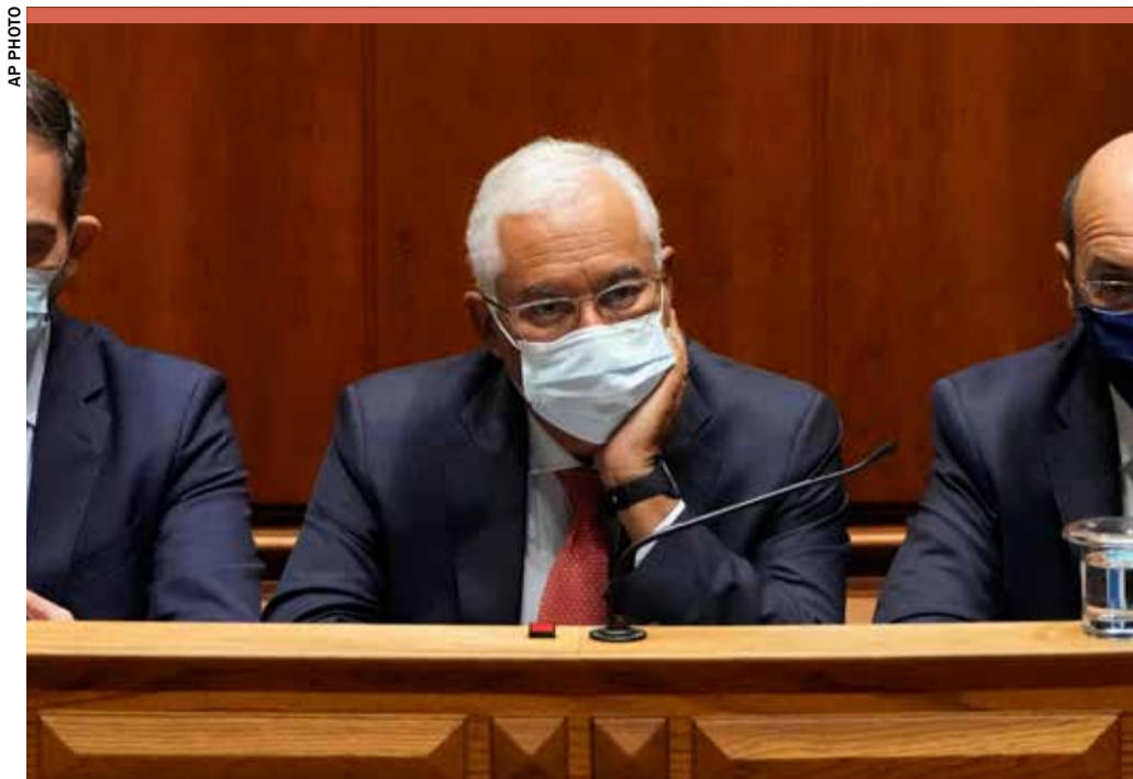
Prime Minister Antonio Costa: Allies from far-left left him and PS alone in the budget vote