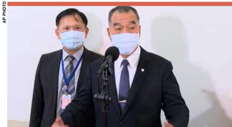
Taiwan's minister Chiu Kuo-cheng

Tensions between Taiwan and China have risen to their highest level in decades, with China sending record-breaking numbers of fighter jets toward international airspace close to the island, and stepping up a campaign of military harassment. Taiwan's Defense Ministry has said that China would have "comprehensive" capabilities to invade the island by 2025.