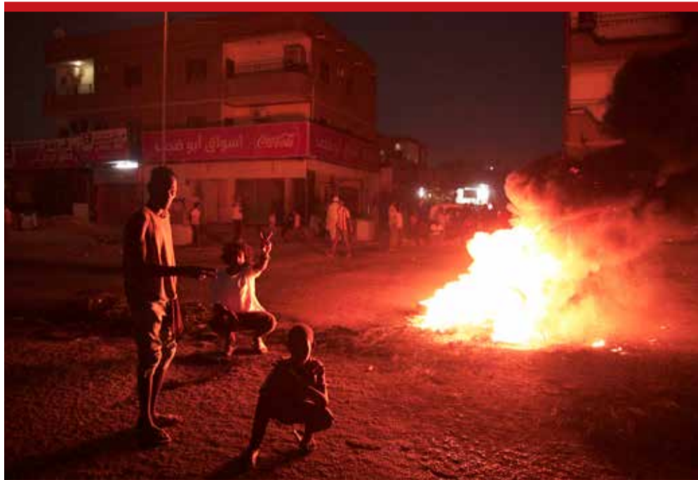
Protest in Khartoum