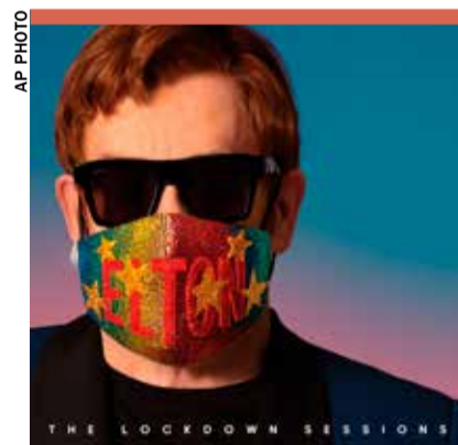
"The Lockdown Sessions," Elton John (Interscope Records)

The album kicks off with the slinky "Cold Heart (PNAU Remix)" — melding John's songs "Kiss the Bride," "Rocket Man," "Where's the