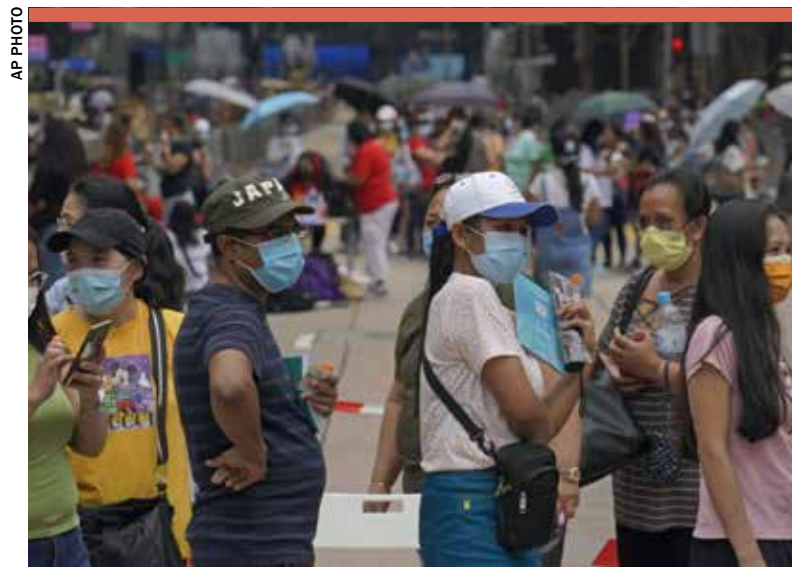
Domestic workers in Hong Kong line up at a temporary testing center for Covid-19

The outbreaks led to the closure of government and entertainment facilities, the cancellation of public events and another round of mass testing, leading to a downturn in tourist arrivals. Another ramification was a regulation imposed by Zhuhai that requires travelers entering the region from Ma-