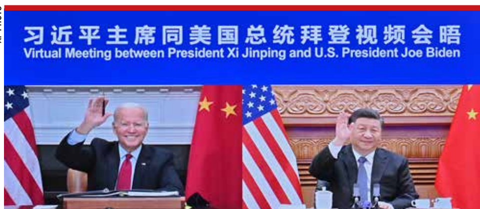
习近平主席同美国总统拜登视频会晤 Virtual Meeting between President Xi Jinping and U.S. President Joe Biden

TAIWAN IN THE MIDDLE XI-BIDEN TALKS RAISE HOPE BUT STRAINS REMAIN