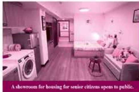
A showroom for housing for senior citizens opens to public.