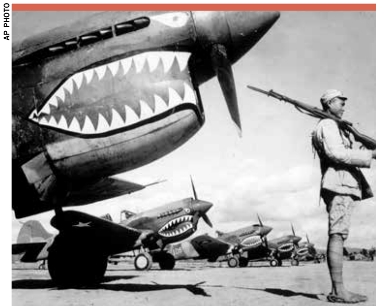
Guarded by a Chinese soldier, a squadron of Curtiss P-40 fighter planes, decorated with the typical shark face of the famed Flying Tigers, are lined up at an unknown airbase in China in 1943

"Our two countries should carry forward the friendship forged in battle by our