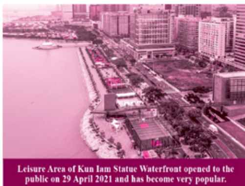
Leisure Area of Kun Iam Statue Waterfront opened to the public on 29 April 2021 and has become very popular.