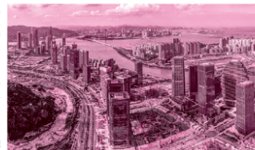
The Guangdong-Macao Intensive Cooperation Zone in Hengqin promotes Macao’s adequate economic diversification.