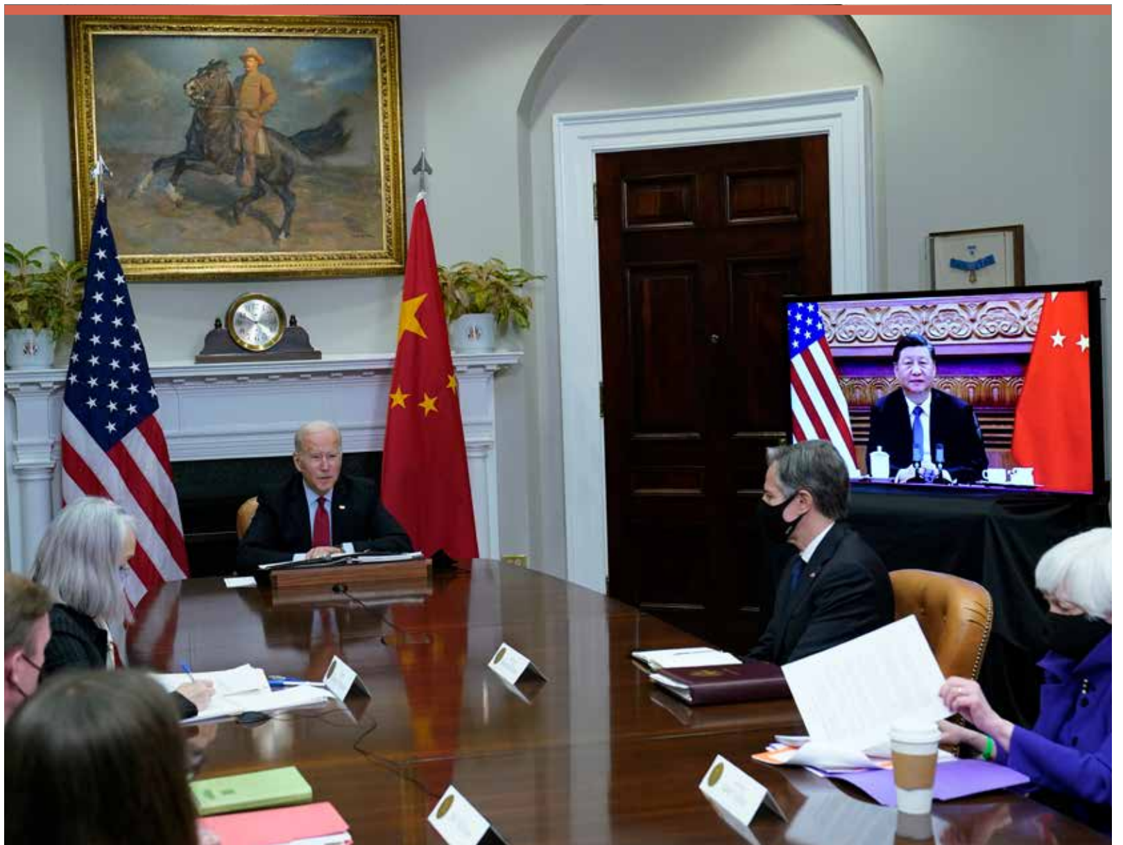
US President Joe Biden meets virtually with Chinese President Xi Jinping from the Roosevelt Room of the White House in Washington