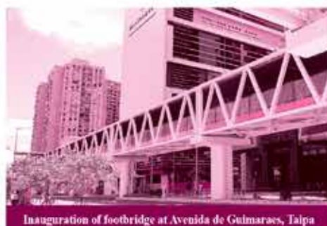
Inauguration of footbridge at Avenida de Gulmaraes, Taipa