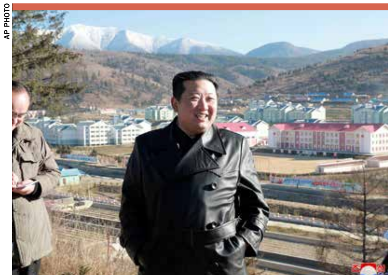
In this undated photo provided on Nov. 16 by the North Korean government, Kim Jong Un inspects the construction site of Samjiyon city development project in Ryanggang province, North Korea

Building Samjiyon into a "model cultured city" was one of the main focuses of a nationwide construction campaign that North Korea had aimed to complete in time for the 75th anni-