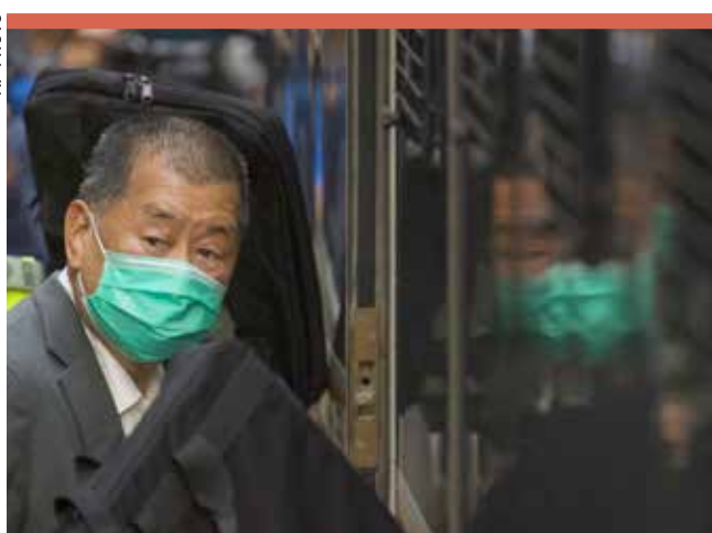
Democracy advocate cum media tycoon Jimmy Lai at the the Hong Kong's Court of Final Appeal (file pic)

Others sentenced Monday included Lee Cheuk-yan, the former chairman