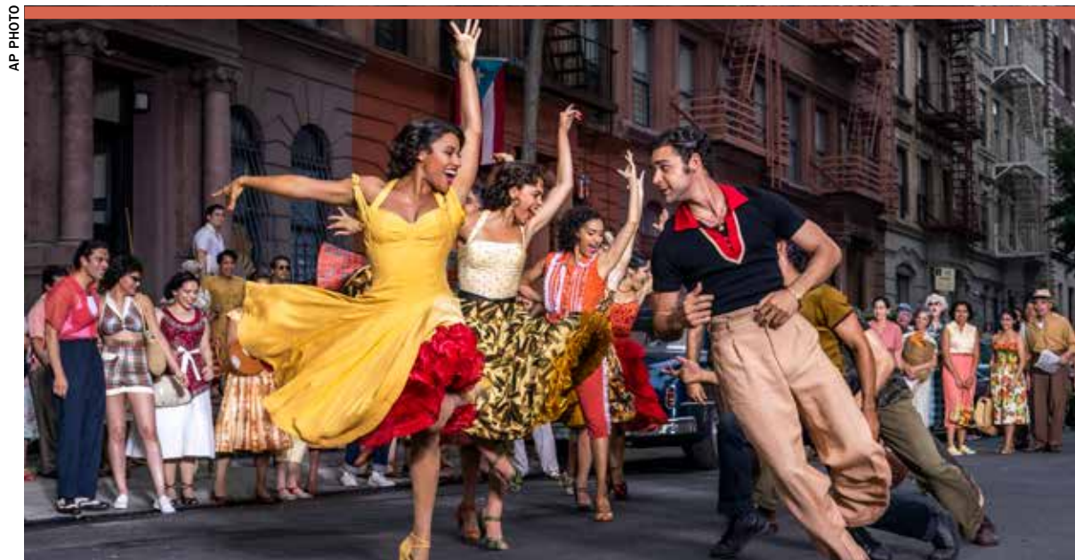
Ariana DeBose as Anita (foreground left) and David Alvarez as Bernardo in scene from "West Side Story"

But "West Side Story" faced a challenging marketplace for both adult-driven releases and musicals. Audiences have steadily returned to multiplexes in the second year of the pandemic,