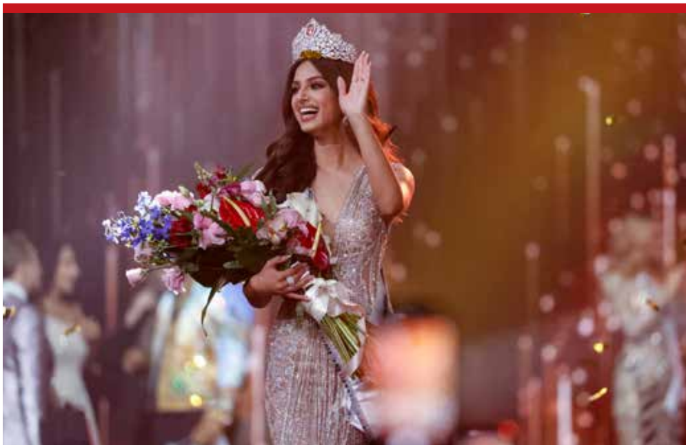
Harnaaz Sandhu waves after being crowned Miss Universe 2021