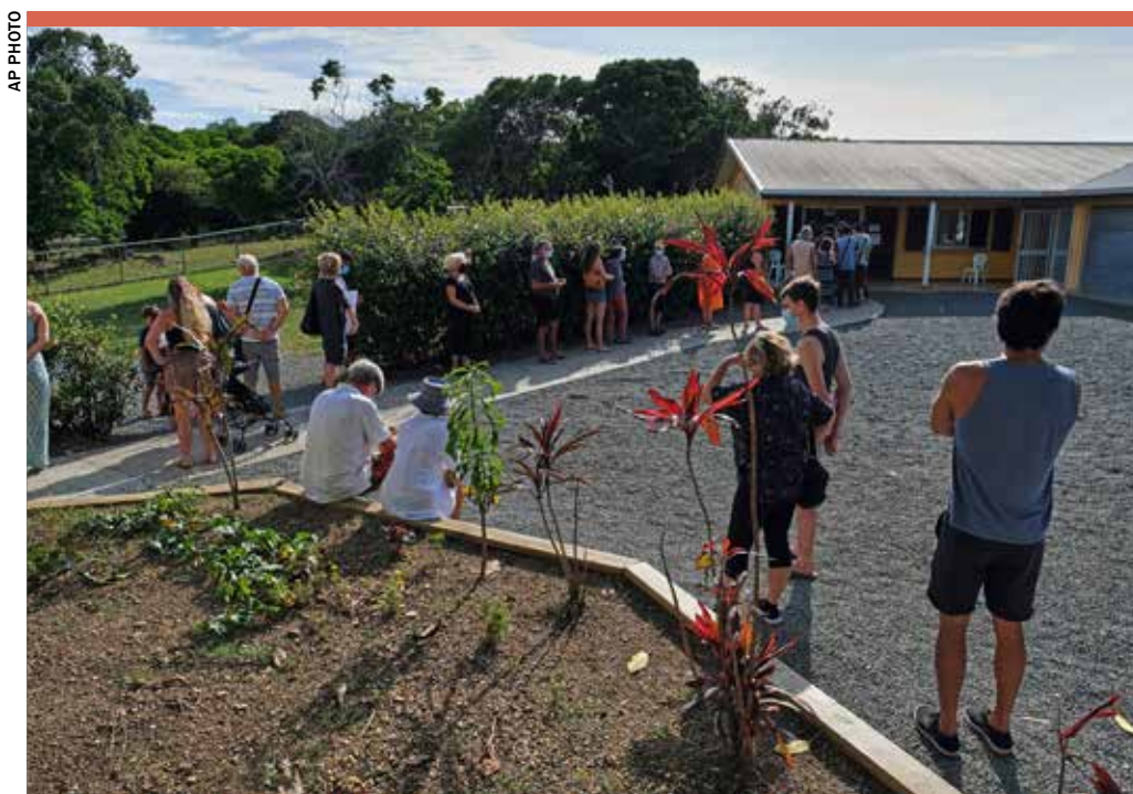
People queue outside a school to vote in a referendum in Noumea, New Caledonia, Sunday