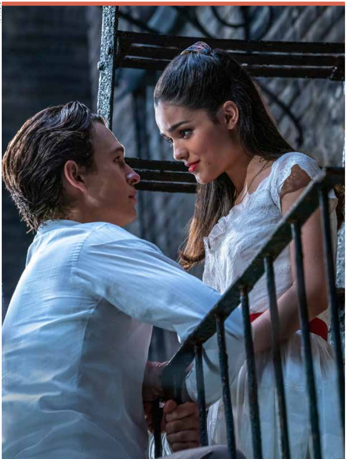
Ansel Elgort as Tony (left) and Rachel Zegler as Maria in "West Side Story"

Zegler's voice is — what makes them work so well is that they aren't isolated, but come out of the more fully formed interiors of the characters. Tony is just out of prison and staying in the drugstore basement of a new character, Valentina (Moreno, connecting movie past and present). His best friend, Jets leader Riff (Mike Faist, terrific), is itching for a fight with the Sharks, and Faist plays him with a hint of mean, knowing despondency. Looking down on Puerto Ricans, he seems to realize, is all he has.