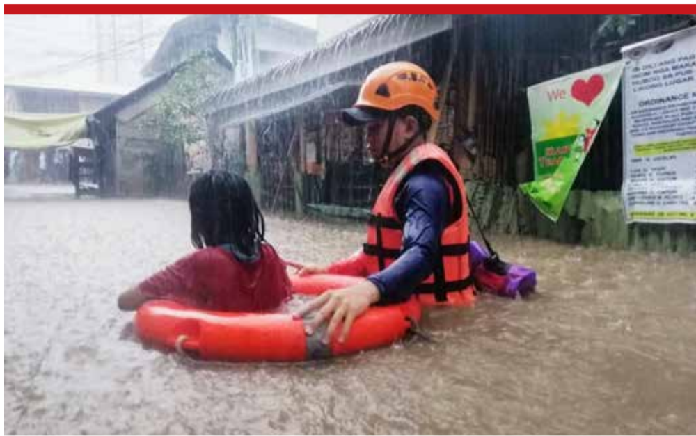
A rescuer assists a girl as they wade through flooding caused by Typhoon Rai in Cagayan de Oro City