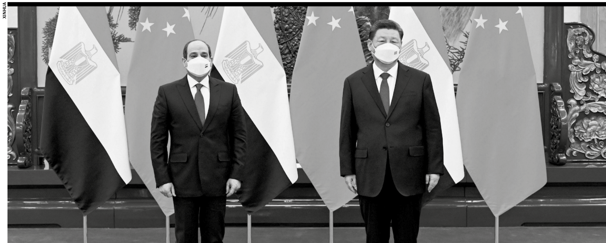
President Xi Jinping (right) meets with Egyptian President Abdel Fattah el-Sisi at the Great Hall of the People in Beijing, Saturday