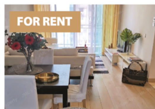
Buckingham HKD 13,900/mth