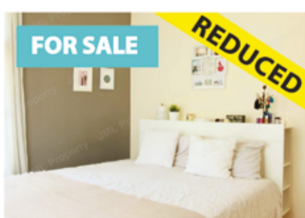
Hellene Gardens HKD 7,680,000