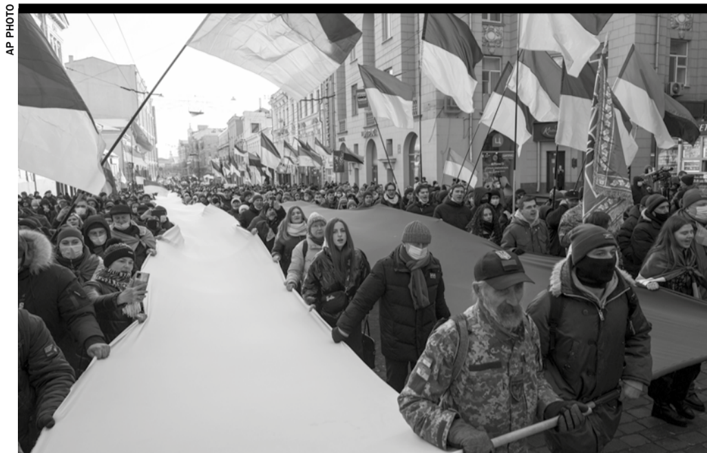
Demonstrators with Ukrainian national flags rally against Russian aggression in the center of Kharkiv, Ukraine's second-largest city

Belarus' authoritarian leader Alexander Lukashenko, who has increasingly relied on the Kremlin's political