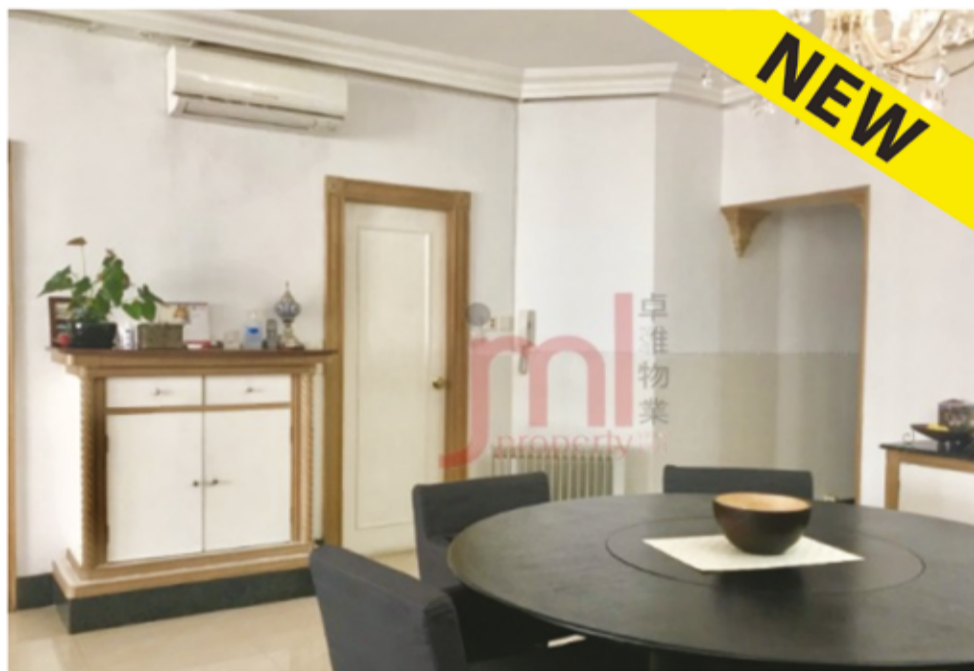
Nova Taipa Gardens HKD 12,880,000 2,500 ft 2 4 2 1

Fantastic apartment in a central location. What was a large four bedroom apartment has been converted into three bedrooms, making the most fabulous master suite with masses of built in storage, dressing area and en suite bathroom. If a fourth bedroom is required it would be simple to revert to the original design.