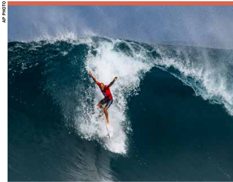
Kelly Slater of the United States surfs in heat 1 of the quarterfinals at the Billabong Pro Pipeline in Haleiwa, Hawaii

"It would be interesting if that happened in the same week," Slater cracked in an interview Sunday (Saturday in Hawaii) with The Associated Press, on the possibility that he'd retire on the heels of Brady's announcement. "We'll see how that goes. I'm contemplating