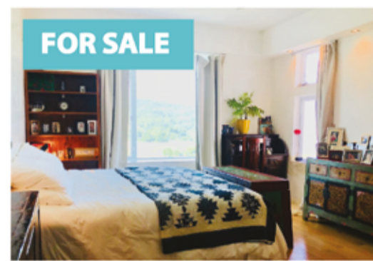
Hellene Gardens HKD 9,988,000