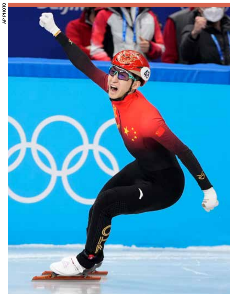
Wu Dajing of China reacts after crossing the finish line to win the mixed team relay final during the short track speedskating competition

"It was thrilling. I was very excited and was filled with all kinds of emotions as I watched the Chinese team approach the finish step by step," said Cheng Hongwei, who had stopped to