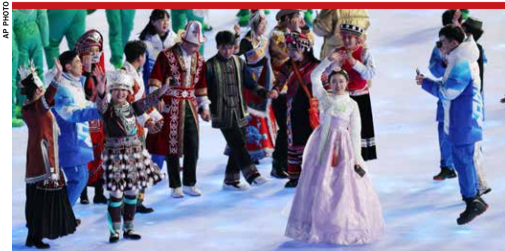
A performer, second from right, clad in a traditional Korean dress waves during the opening ceremony of the 2022 Winter Olympics in Beijing