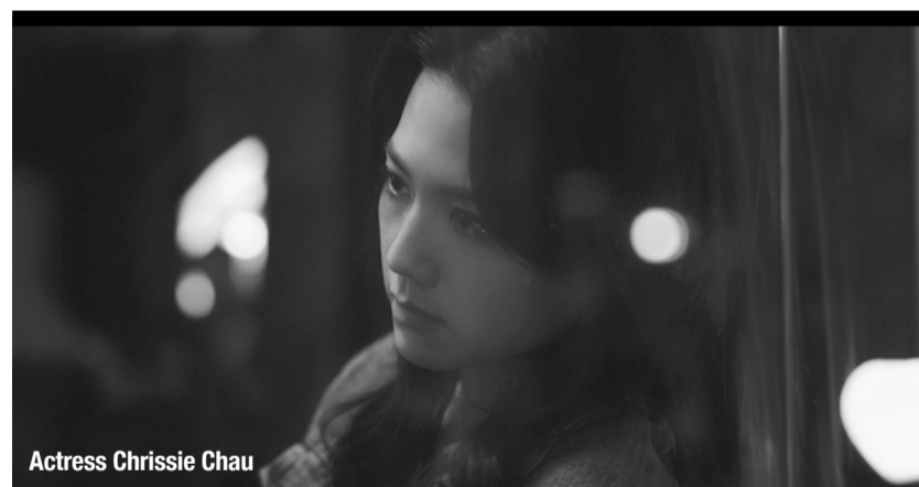
Actress Chrissie Chau

The IFTM Educational Restaurant is open for reservations during the Macanese Food Promotion Week. JW