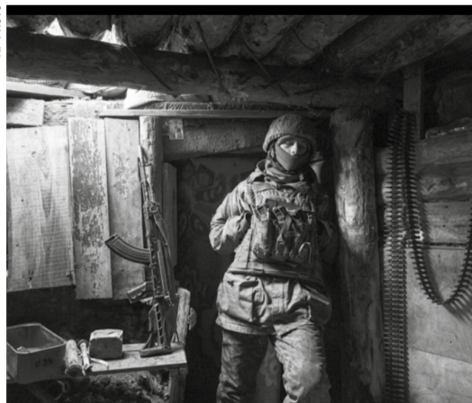
A Ukrainian serviceman stands in a shelter on a position at the line of separation between Ukraine-held territory and rebel-held territory near Zolote, Ukraine, Saturday

Zelenskyy spoke hours after separatist leaders in eastern Ukraine ordered a full military mobilization