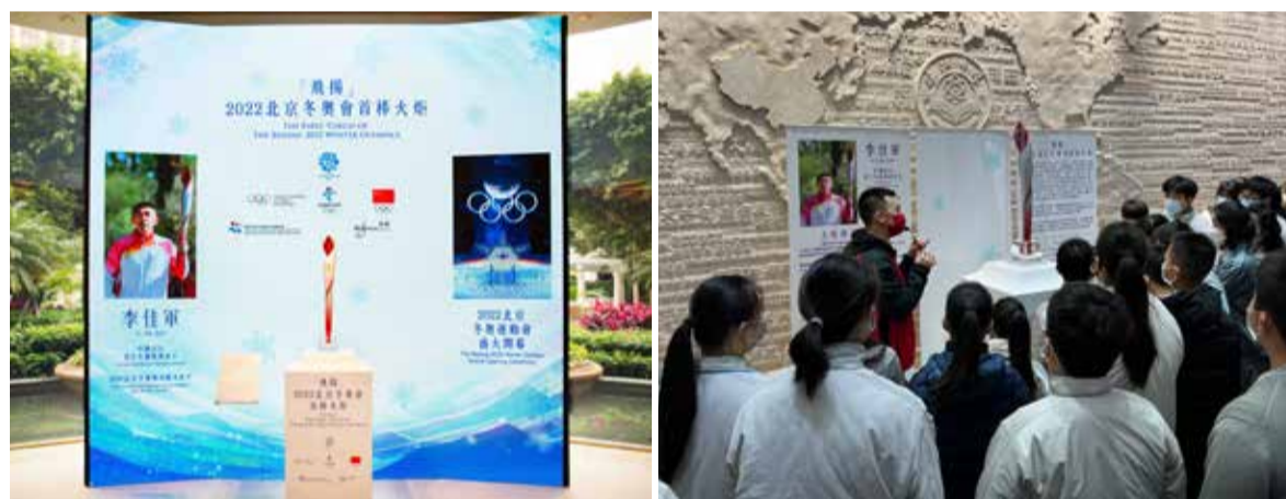
The Olympic torch was on display in the lobby of Wynn Macau for 12 consecutive days, followed by an exhibition tour to 10 local schools.