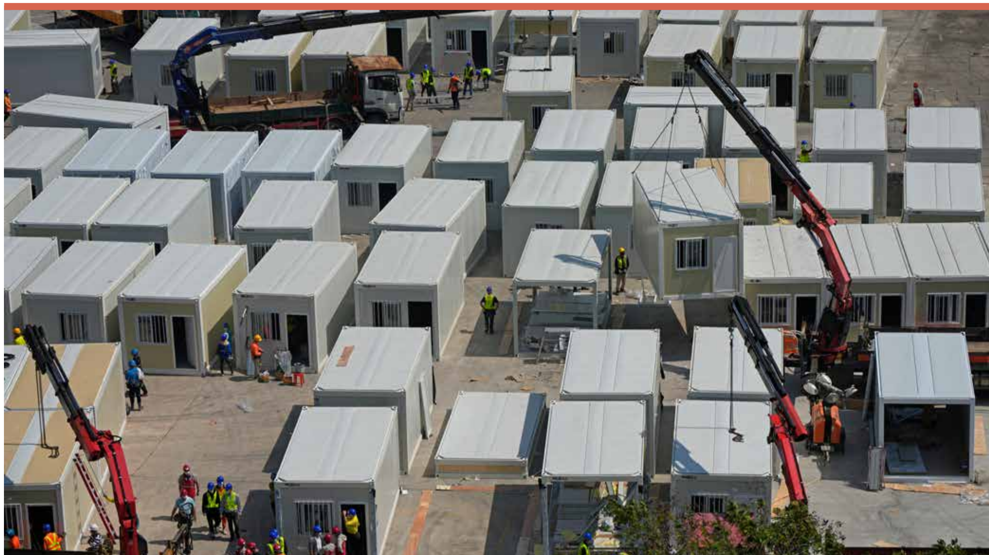
An aerial view shows a construction site of a new makeshift COVID-19 hospital and isolation facilities, in Tsing Yi of Hong Kong