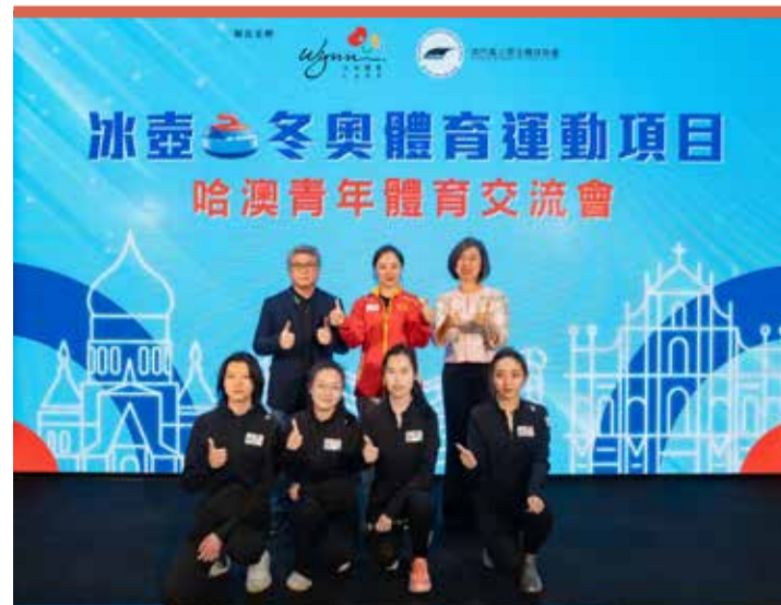
Wynn invited an Olympic medal-winning curling coach and athletes from Harbin to interact with members of the public.