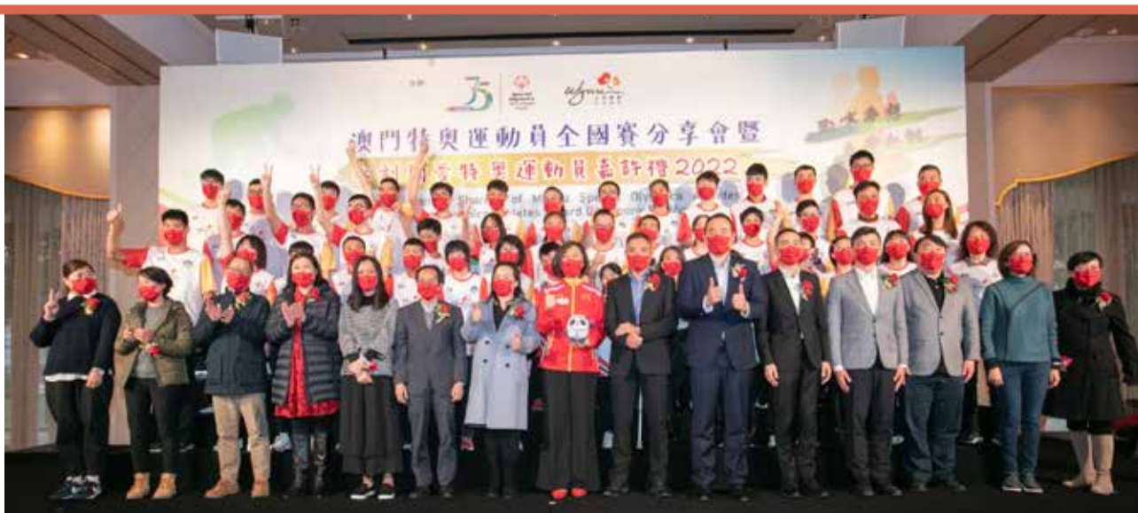
Wynn joined hands with Macau Special Olympics to honor athletes for their outstanding performance and achievements.