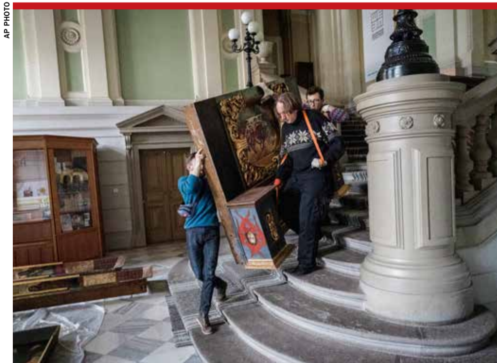
Workers move a baroque sacred art piece in the Andrey Sheptytsky National Museum in the western Ukrainian city of Lviv, Friday

The Chinese government says most of the spending increases will go toward improving welfare for troops. Observers say the budget omits much of China's spending on weaponry, most of which is developed domestically.