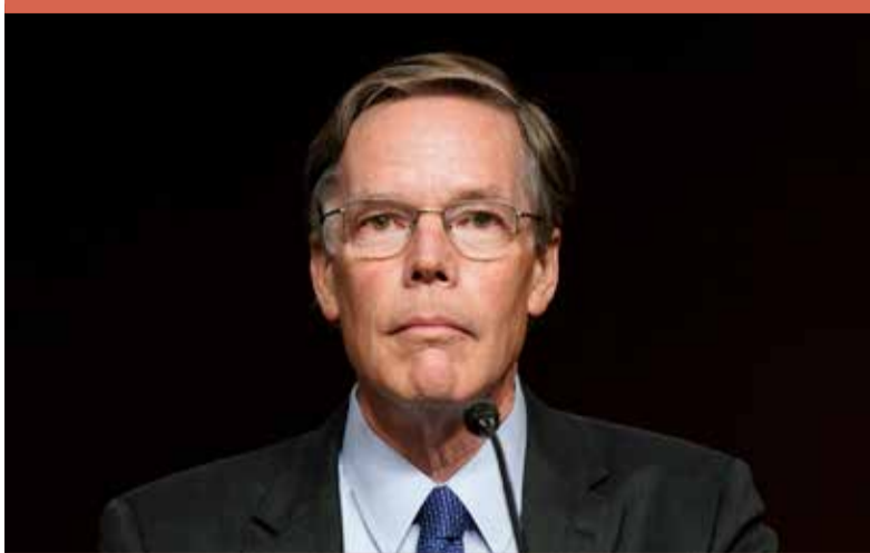
New US Ambassador Nicholas Burns