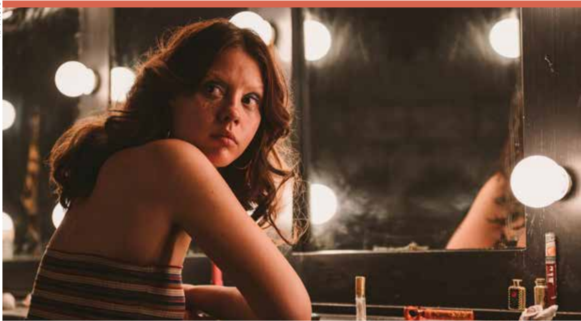
Mia Goth in a scene from “X”

touchstone here, but there are references throughout to films like “Psycho” and “The Shining.” Yet while a whole host of movies have eagerly cribbed from those films and others that “X” alludes to, it’s striking how much the tensions and palpably human characters of “X” feel realistically grounded and viscerally their own. It’s the difference between a glossy knockoff and the genuine article.