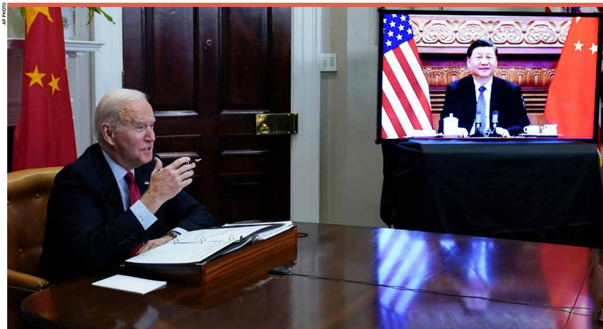
U.S. President Joe Biden meets virtually with President Xi Jinping, last November