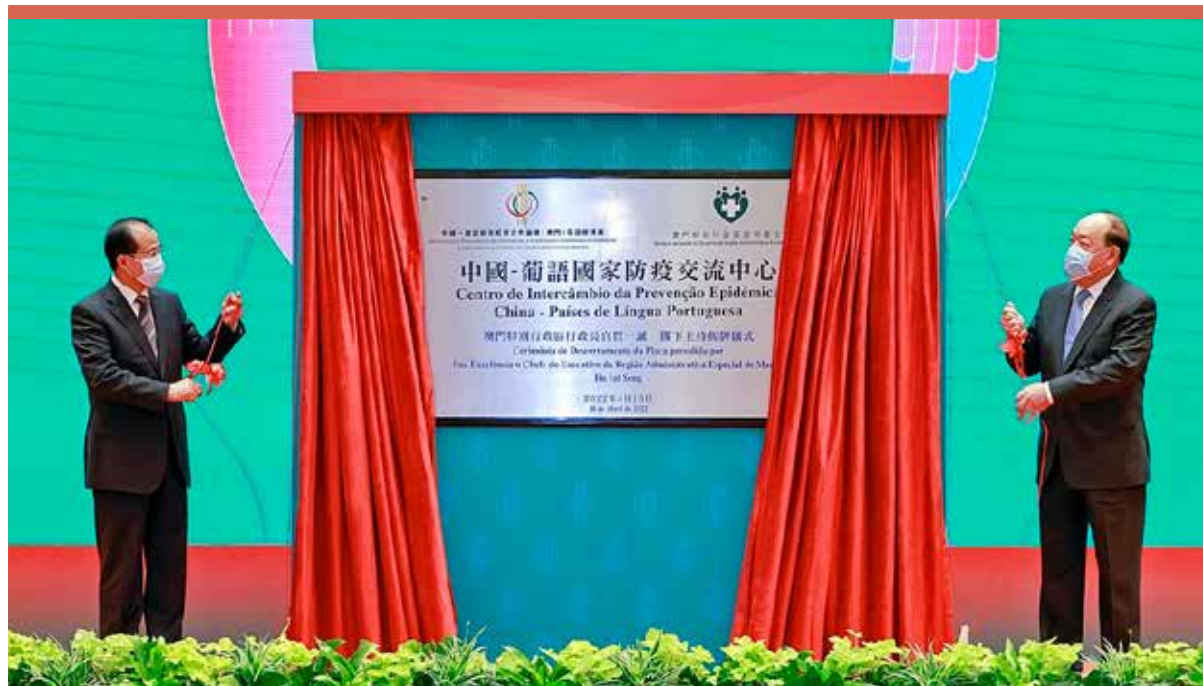
Chief Executive Ho Iat Seng and the director of the Liaison Office of the Central People's Government in the MSAR, Fu Ziyang, officiate at the unveiling ceremony of the plaque of the Anti-epidemic Exchange Centre

that China would uphold the principle of 'One country, two systems', Macau residents administering Macau and a high degree of autonomy in Macau.