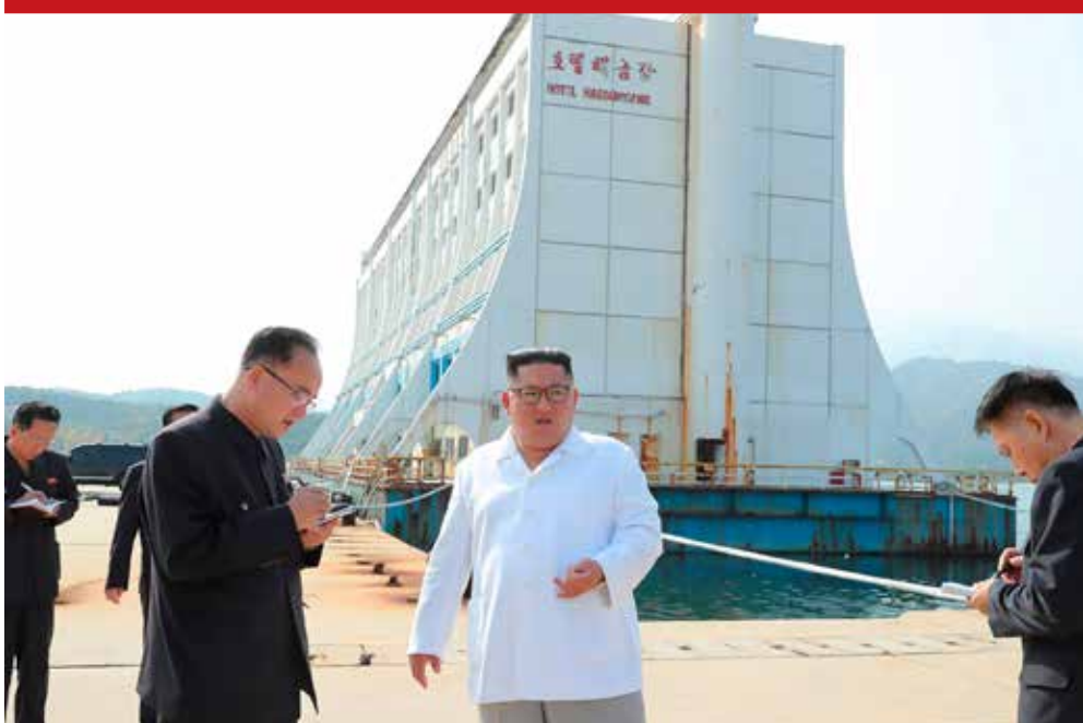
In this undated photo provided on Oct. 23, 2019, by the North Korean government, Kim Jong Un, center, visits the Diamond Mountain resort in Kumgang, North Korea