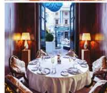
Top: Grill 58, MGM COTAI Bottom: Aux Beaux Arts, MGM MACAU

Creating Easter eggs is one of the fun traditions of Easter, but this year, you can make it even more delightful by participating in the Chocolate Egg Painting Workshop at Anytime, MGM COTAI . On April 16 and 17, bring along your little ones to put on their creative hat and bring home their DIY treats!