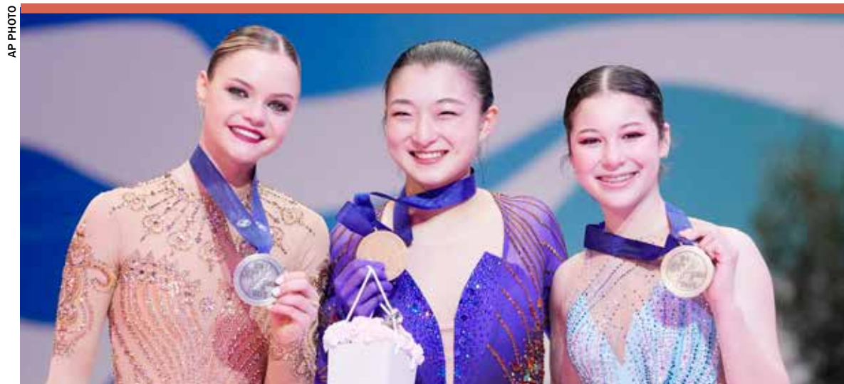
Loena Hendricks of Belgium, silver medal, left, Kaori Sakamoto of Japan, gold medal, center, and Alysa Liu of the U.S., bronze medal, at the Figure Skating World Championships in Montpellier, south of France, March 25, 2022