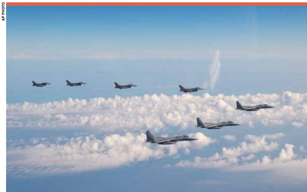
Three F-15 warplanes of the Japanese Self-Defense Force, front, and four F-16 fighters of the U.S. Armed Forces fly over the Sea of Japan, on Wednesday