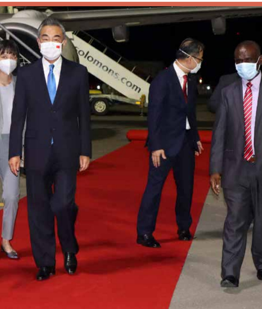
escorted from his plane on his arrival in Honiara, Solomon Islands, early yesterday