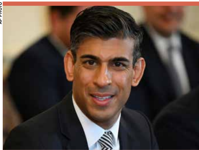
Britain's Chancellor of the Exchequer Rishi Sunak

Johnson had opposed a windfall tax, and his Conservative government previously said that imposing one would deter investment in the U.K.'s energy sector. But the government is under heavy pressure to act as skyrocketing energy and food bills cause financial hardship for British