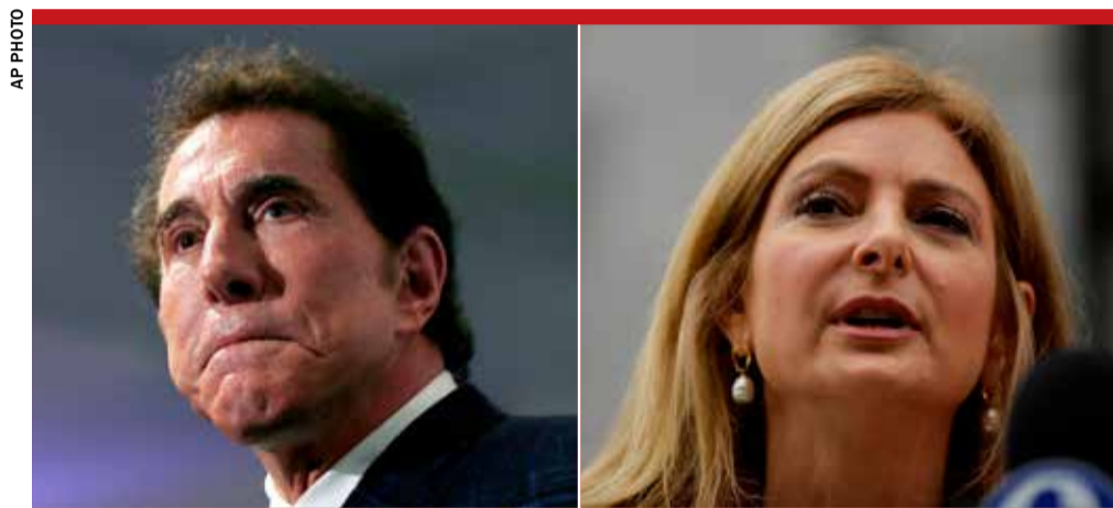
Steve Wynn vs attorney Lisa Bloom