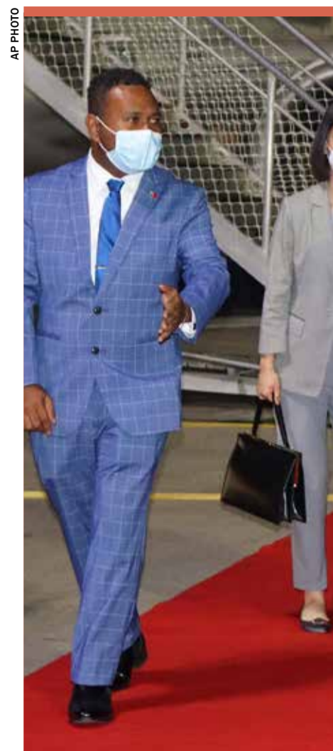
Foreign Minister Wang Yi, center, is

"This operation is not aimed at a third party and has nothing to do with the current international and regional situation," he said in a video statement posted Wednesday on the Defense Ministry website. MDT/AP