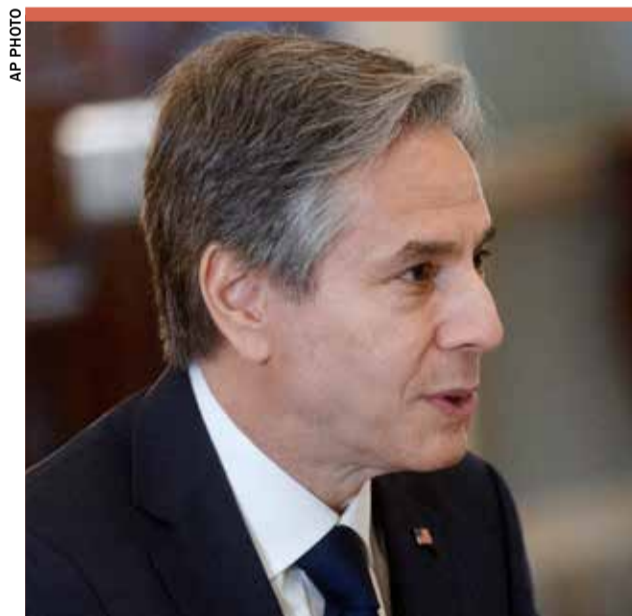
U.S. Secretary of State Antony Blinken

Biden raised eyebrows during that trip when he said that the United States would act militarily to