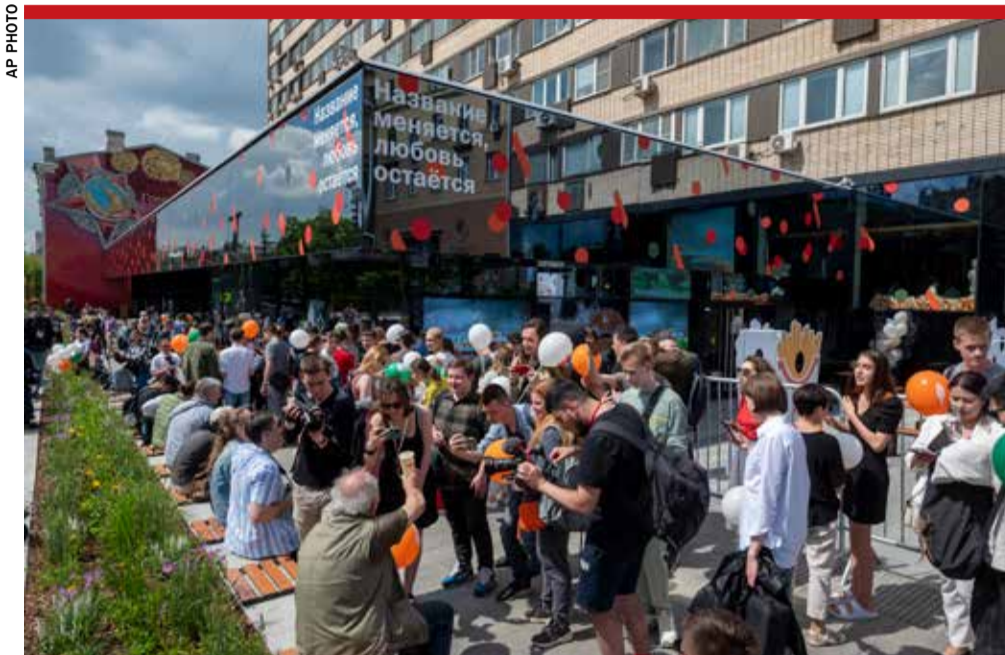
People lineup to visit a newly opened fast food restaurant in a former McDonald's outlet in Bolshaya Bronnaya Street in Moscow