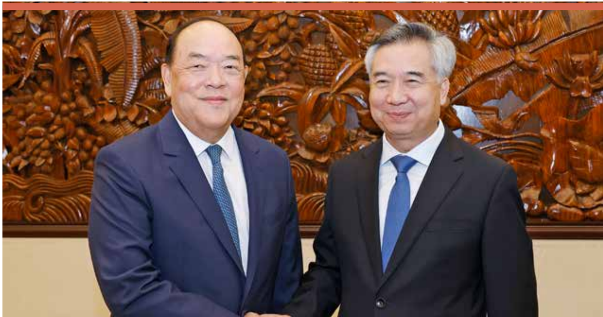
Chief Executive Ho Iat Seng (left) and Secretary of the CPC Guangdong Provincial Committee Li Xi