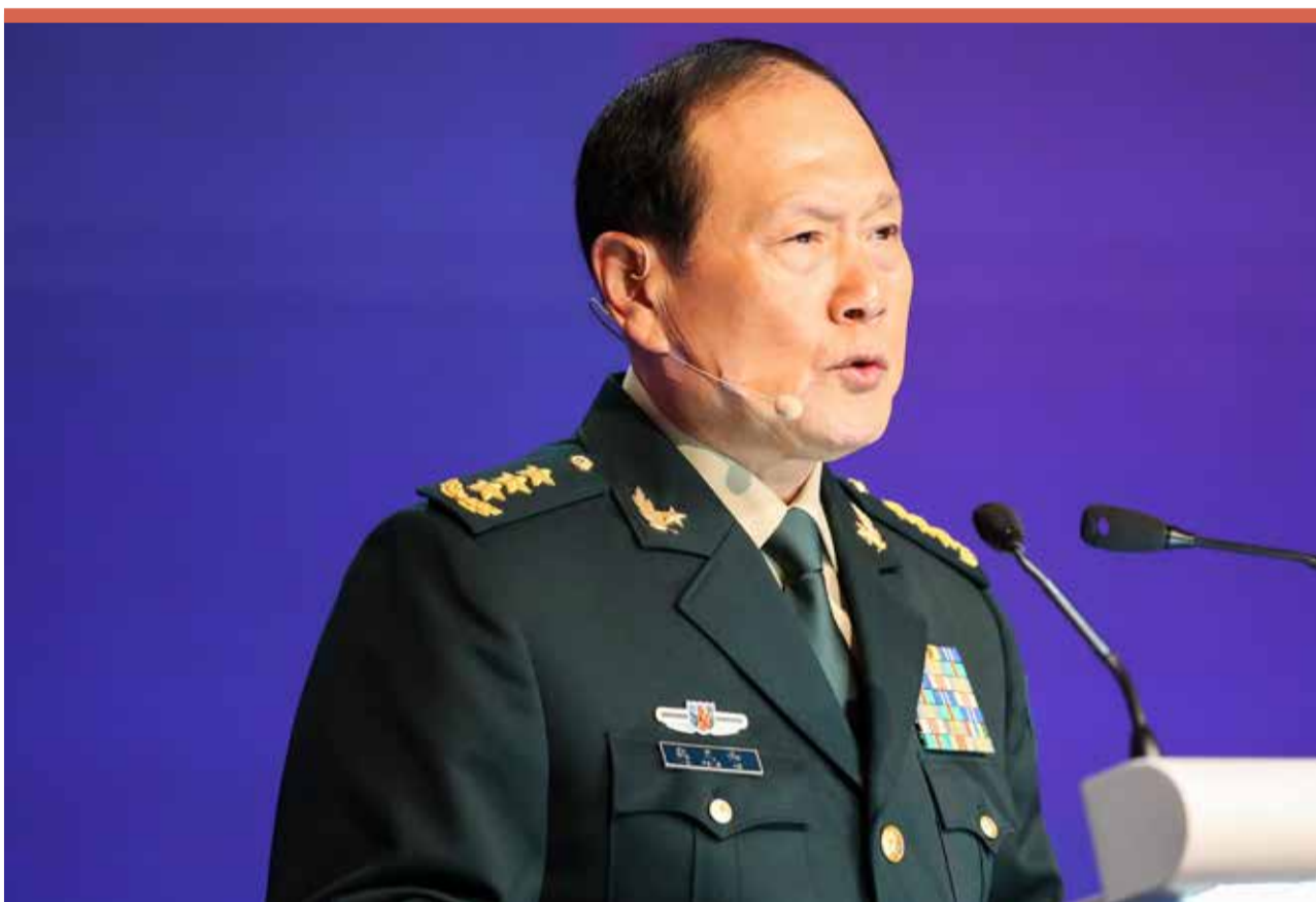
Defense Minister General Wei Fenghe speaks at a plenary session during the 19th International Institute for Strategic Studies

The U.S. and its allies have responded with so-called freedom of navigation patrols in the South China Sea and Taiwan Strait, sometimes encountering a pushback from China's military.