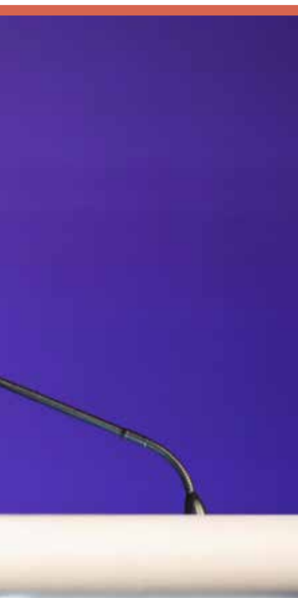
Shangri-la Dialogue, in Singapore

Taiwan and China split during a civil war in 1949, but China claims the island as its own territory, and has not ruled out the use of military force to take it, while maintaining it is a domestic political issue.