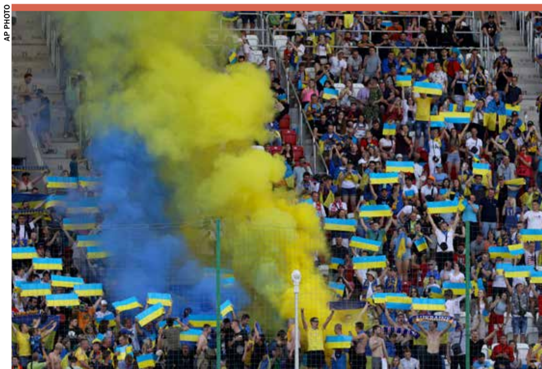
Ukraine supporters cheer on the stands during the UEFA Nations League soccer match between Ukraine and Armenia, in Lodz, Poland

"Sievierodonetsk is not completely 100% liberated," Pasechnik said Saturday, alleging that the Ukrainians were shelling the city from