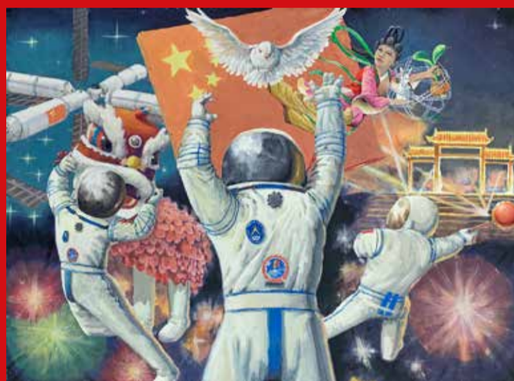
Inter School First Class Ling Nan Middle School