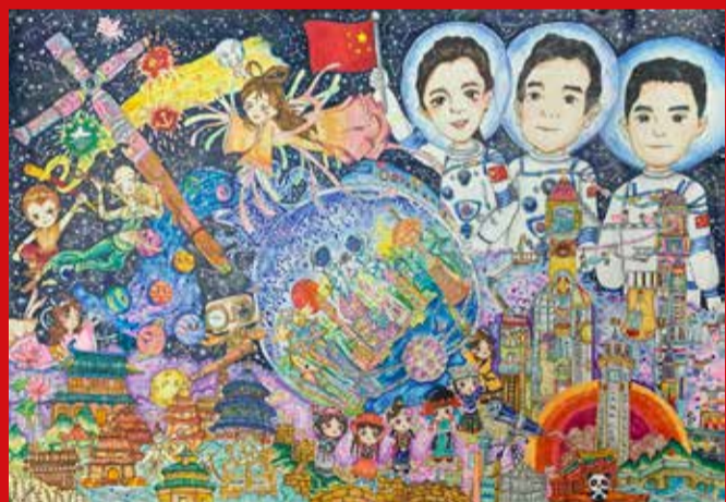
Inter School First Class Fu Luen School