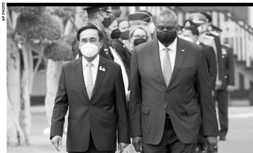
U.S. Defense Secretary Lloyd Austin (right) escorted by Thailand Prime Minister Prayuth Chan-ocha, who is also defense minister

A U.S. Defense Department statement said Austin's visit, his first to Thailand as defense secretary,