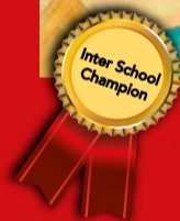
Inter School Champion Escola Lin Fong Pou Chai