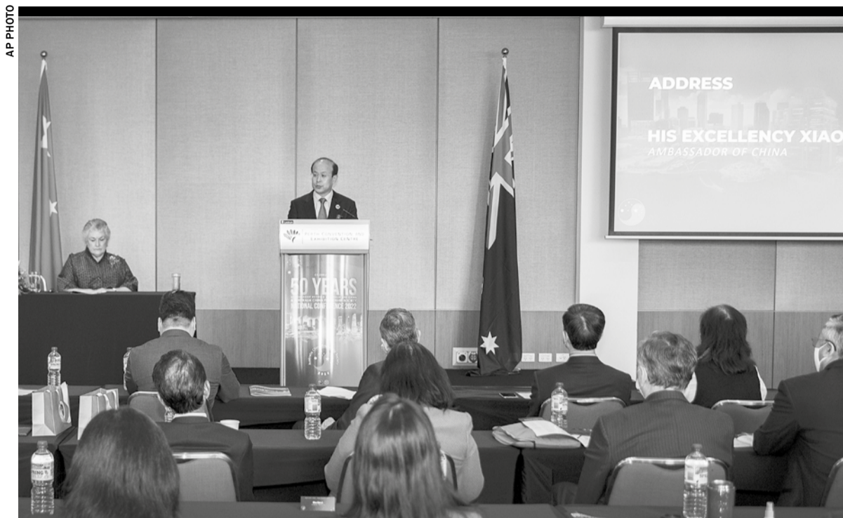
Chinese Ambassador to Australia Xiao Qian speaks at a national conference of the Australia China Friendship Society in Perth

ting as a thawing of a diplomatic deep freeze between the countries.