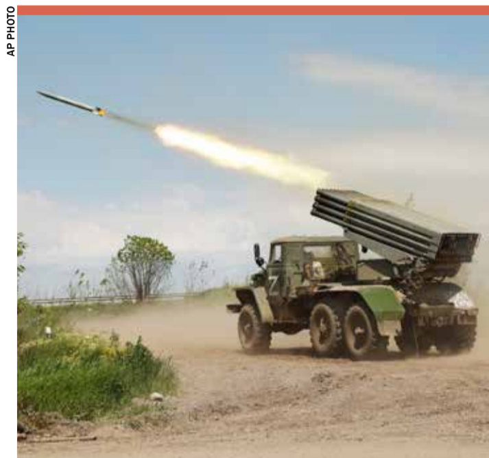
A Donetsk People's Republic militia's multiple rocket launcher fires from its position not far from Panteleimonivka, in territory under the government of DPR, eastern Ukraine

When the war was going badly for Russia, many thought President Vladimir Putin might claim victory after