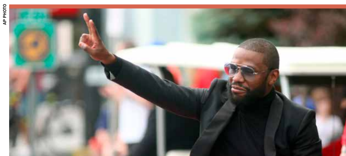
International Boxing Hall of Fame class of 2021 inductee Floyd Mayweather acknowledges paradegoers during the annual Parade of Champions

Mayweather, who retired unbeaten in 50 fights, headlined the three classes that were inducted yesterday. The pandemic forced the postponement of the