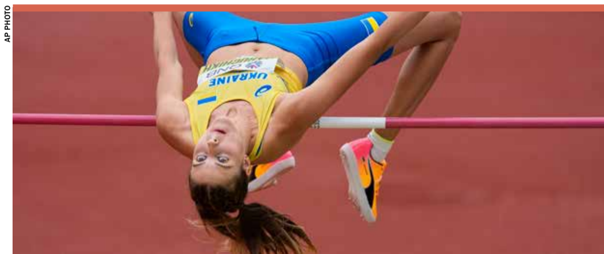
Yaroslava Mahuchikh, of Ukraine, competes during qualifying for the women's high jump at the World Athletics Championships, Saturday

She easily made it through qualifying Saturday, and is a favorite to win a gold medal Tuesday in part