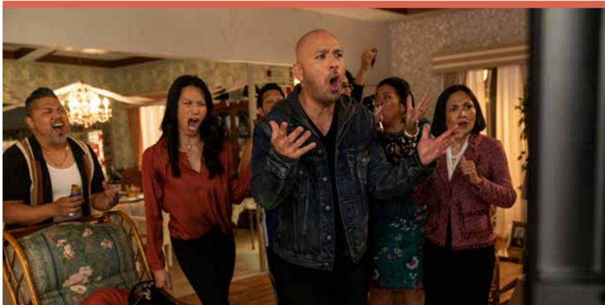
Jo Koy (center) in "Easter Sunday"