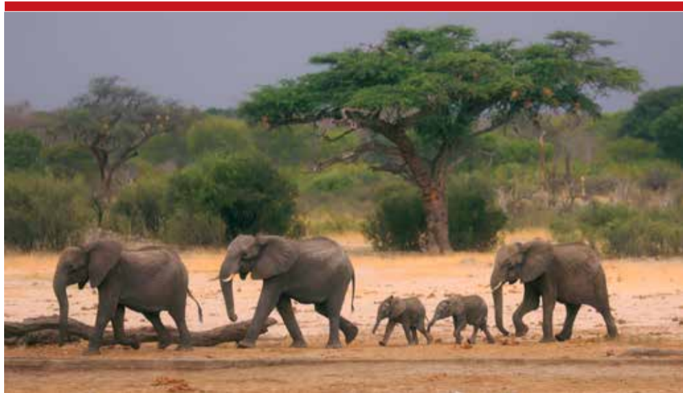
A herd of elephants make their way through the Hwange National Park, Zimbabwe