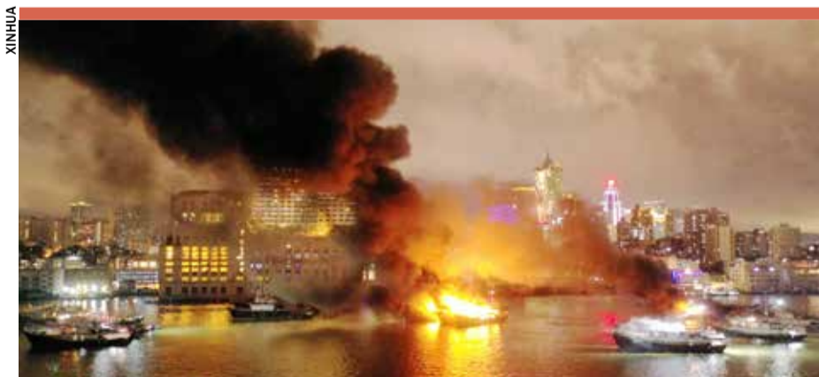
Inner Harbour fire consumes half dozen ships in April