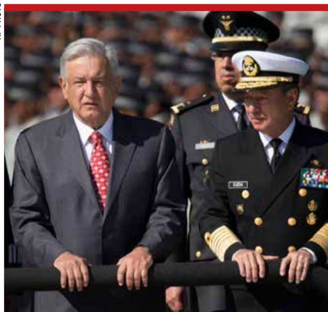
Mexican President Andres Manuel Lopez Obrador (left) surveys National Guard troops as the new force is presented at a ceremony, in Mexico City, June 30, 2019

"A constitutional reform would be ideal, but we have to look for ways, because they (the opposition) instead of helping