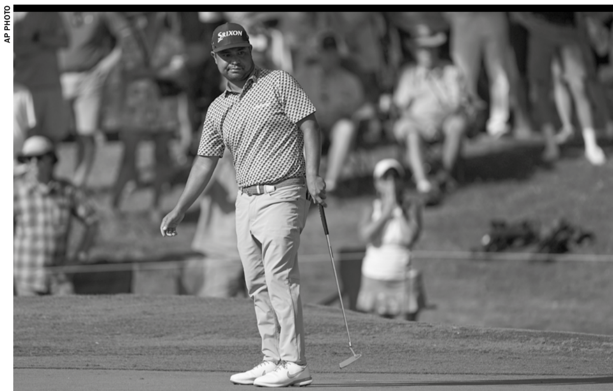
J.J. Spaun watches his putt on the 18th green during the third round of the St. Jude Championship golf tournament, Saturday

"That's been one of my goals probably since the start of the year is to try to get to that top spot," Smith said. "Try and chase it down."