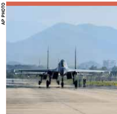
Air force and naval aviation corps of the Eastern Theater Command of the Chinese People's Liberation Army (PLA) fly planes at an unspecified location in China, Aug. 4, 2022

It also follows China's sending warships, missiles and aircraft into the waters and air around