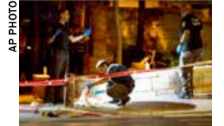
Israel A Palestinian gunman opened fire at a bus near Jerusalem's Old City early yesterday, wounding eight Israelis in an attack that came a week after violence flared up between Israel and militants in Gaza, police and medics said. Two of the victims were in serious condition, including a pregnant woman with abdominal injuries and a man with gunshot wounds to the head and neck, according to Israeli hospitals treating them.

The U.N. Human Rights High Commissioner's office said last week that militarizing civil institutions, such as policing, weakens democracy.