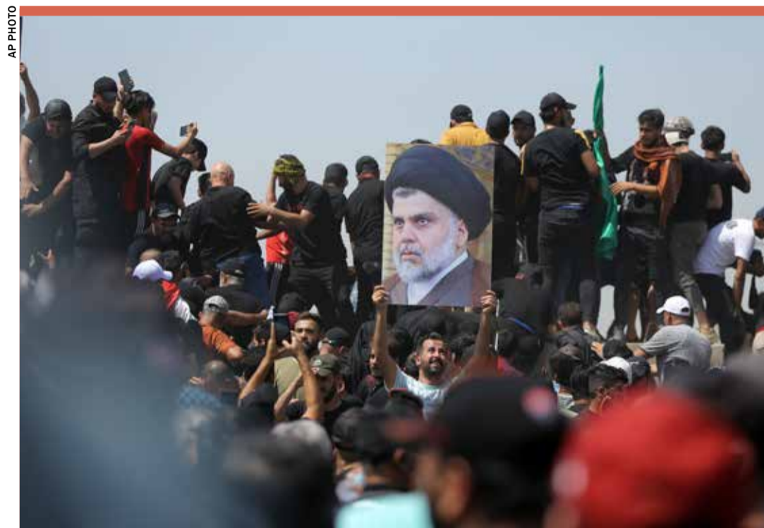
A protester holds a poster depicting Shiite cleric Muqtada al-Sadr on a bridge leading towards the Green Zone area in Baghdad, Iraq, July 30, 2022

ni's seminary in the holy city of Najaf said he has not used his influence because he did not want to appear to take sides in the most acute internal Shiite crisis since 2003. They spoke on condition of anonymity because they were not authorized to brief the media.