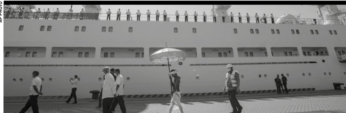
A Sri Lankan traditional dancer carries a decorative umbrella as the crew of Chinese scientific research ship Yuan Wang 5 waves Chinese flags after arriving at Hambantota International Port in Hambantota, yesterday

The closely watched developments surrounding the vessel underscore the competing interests of regional giants India and China in the small island nation. For more than a decade, Sri Lanka's strategic location in the Indian Ocean and along one of the busi-