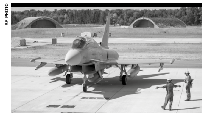
A German Eurofighter gets ready for takeoff at Neuburg Air Base in Neuburg An Der Donau, Germany, Monday

The Luftwaffe said personnel were sent from Germany to repair it further so