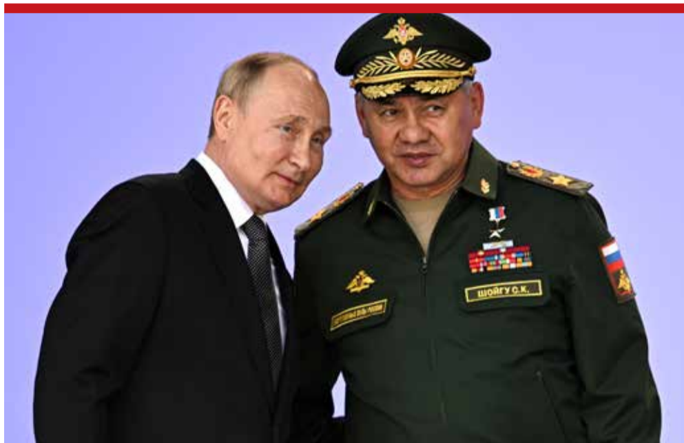
Russia's President Vladimir Putin and Russian Defense Minister Sergei Shoigu attend the opening of the Army 2022 International Military and Technical Forum in Moscow, Monday