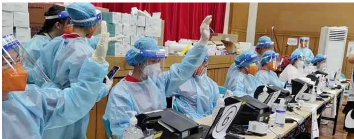
Wynn volunteers joined the frontline to support anti-pandemic duties at NAT stations