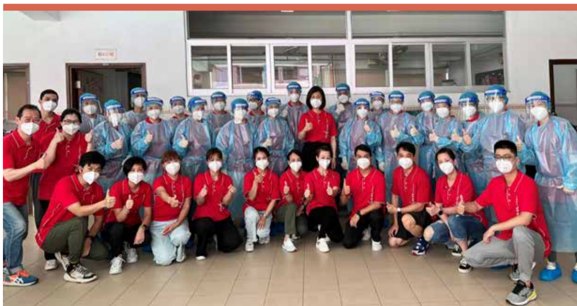
Wynn worked closely with the local community throughout the 14 rounds of citywide NAT, together contributing to the city's triumph over the outbreak