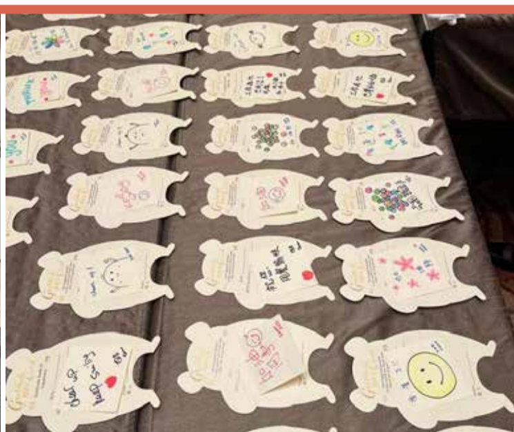
Wynn team members cheered each other on and expressed gratitude to those involved in the fight against the pandemic