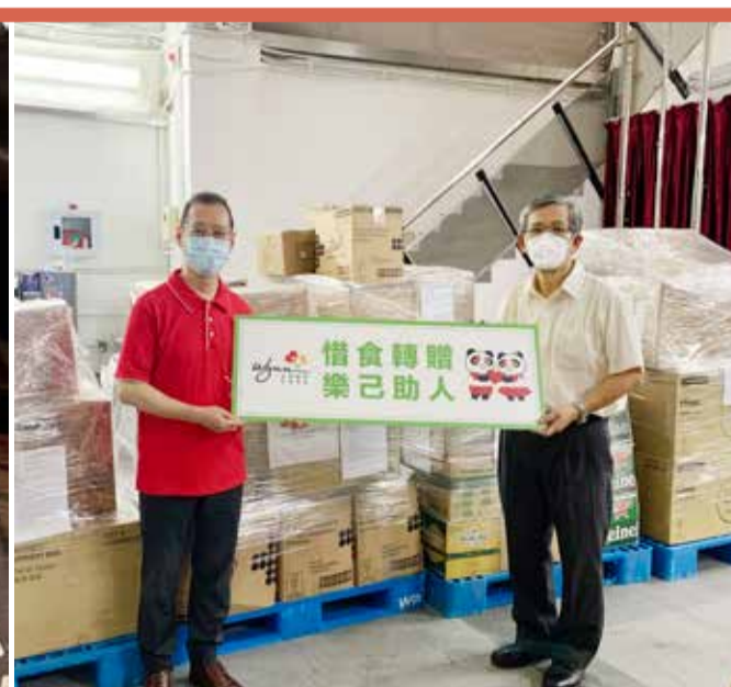
Wynn supported Caritas Macau and donated relief packs to the underprivileged