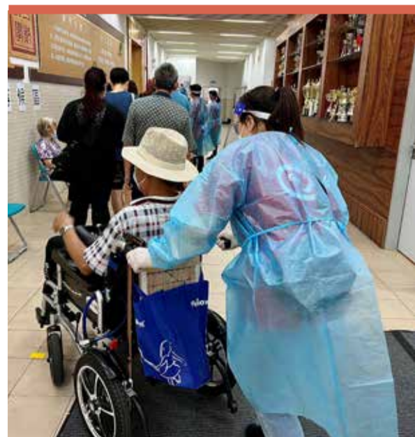
Wynn Volunteers reached out to assist people with special needs

Through this initiative, Wynn sought to reduce the pressure they were experiencing in daily life by fulfilling their urgent needs and helping to tide them over in this difficult time by expressing a sense of love and care.