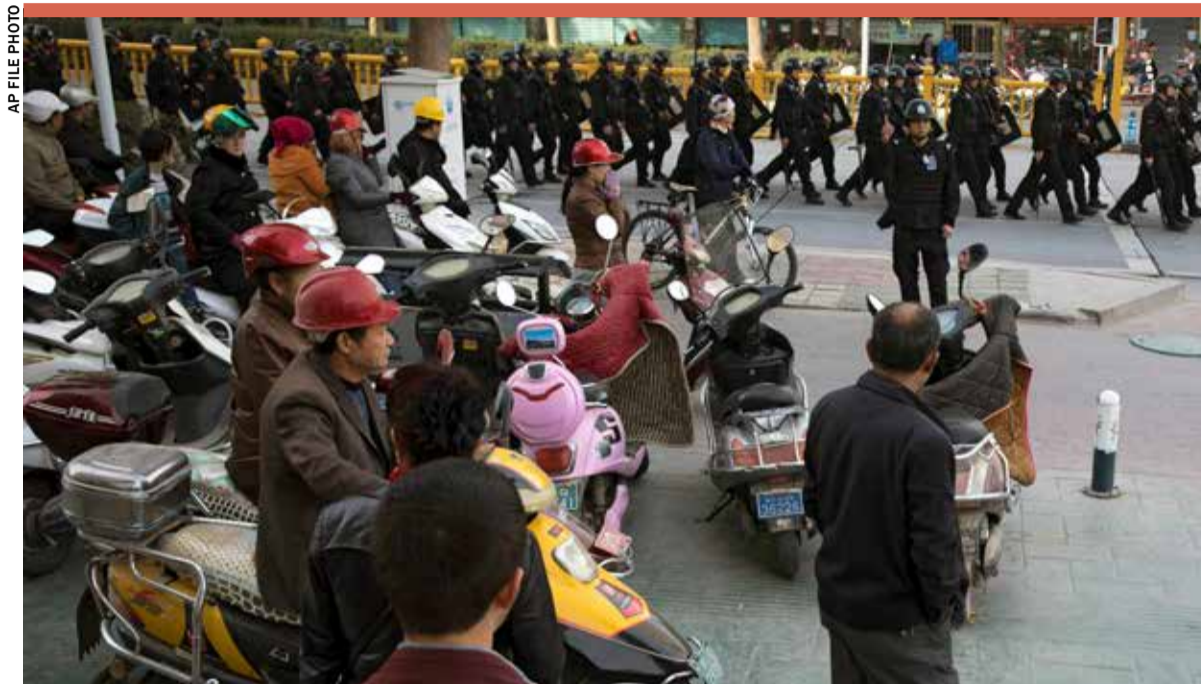
Residents watch a convoy of security personnel armed with batons and shields patrol through central Kashgar in Xinjiang (2017)

In a sternly worded protest that the U.N. posted with its report, China's diplomatic mission in Geneva said it firmly opposed the