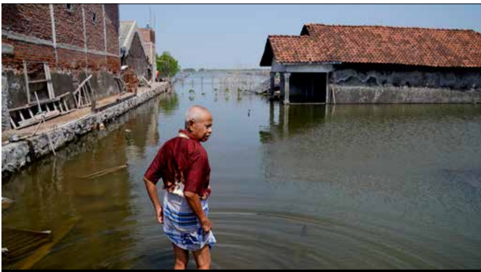
On the northern coast of Central Java, Indonesia, villages are hit hard as sea levels rise, one of many effects of climate change. Many homes have been "raised" with cement or dirt several times over in an effort by occupants to keep dry.