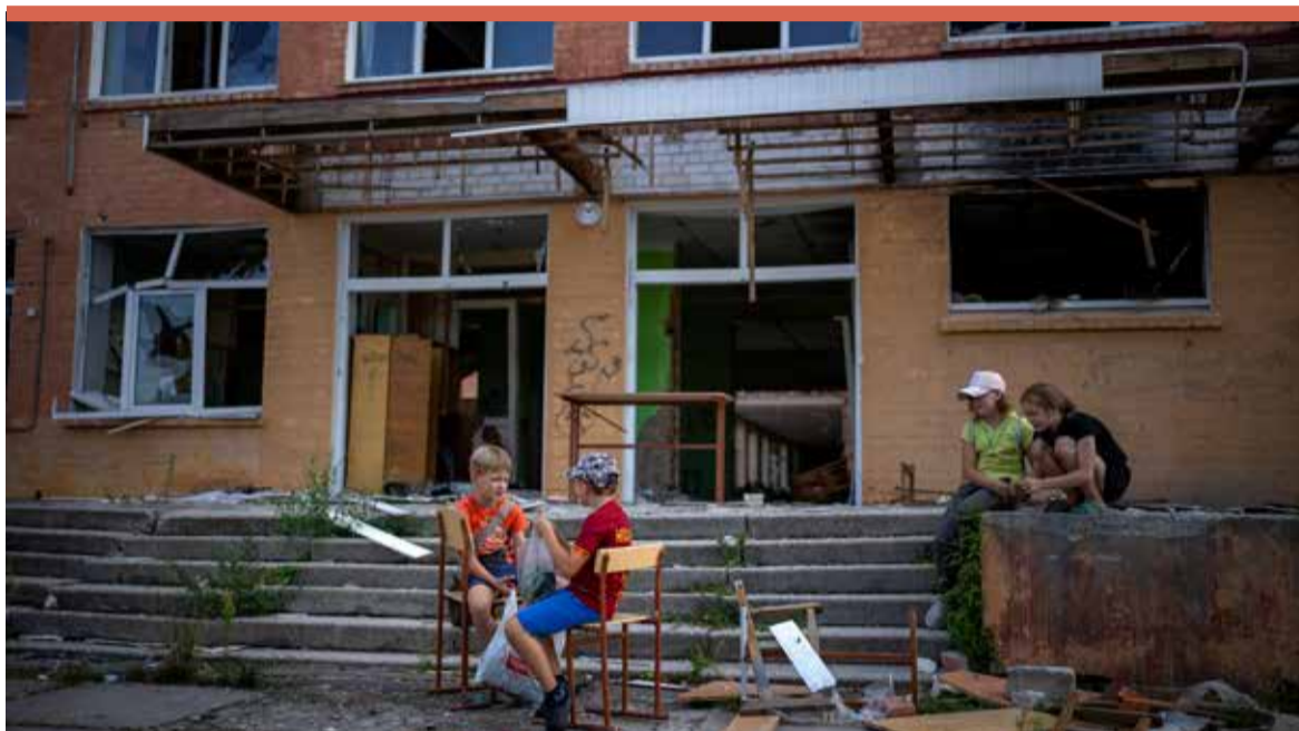
Children play outside their Chernihiv School #21, which was bombed by Russian forces in March, in Chernihiv

just 20 miles (35 kilometers) from the Belarus border, who gathered at their badly damaged school Tuesday to pick up textbooks for studying online. While waiting, they played a version of "Truth or Lie," where players tried to guess whether their opponent's assertion about the number of missiles they saw from their window was true or false.