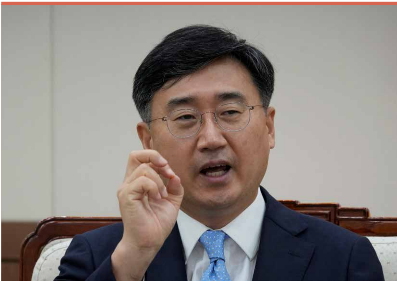
South Korean Vice Defense Minister Shin Beomchul speaks during an interview at the Defense Ministry in Seoul yesterday