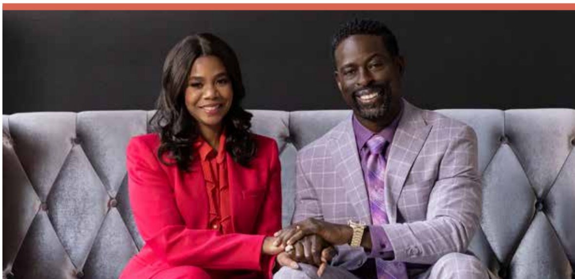
Regina Hall (left) and Sterling K. Brown in "Honk for Jesus. Save Your Soul"

revival, leading up to an Easter reopening. When Lee-Curtis steps in chewing gum and Trinitie asks the camerawoman to edit around that, she gets no reply. "Oh, that's right," she says. "You're the fly-on-the-wall type."