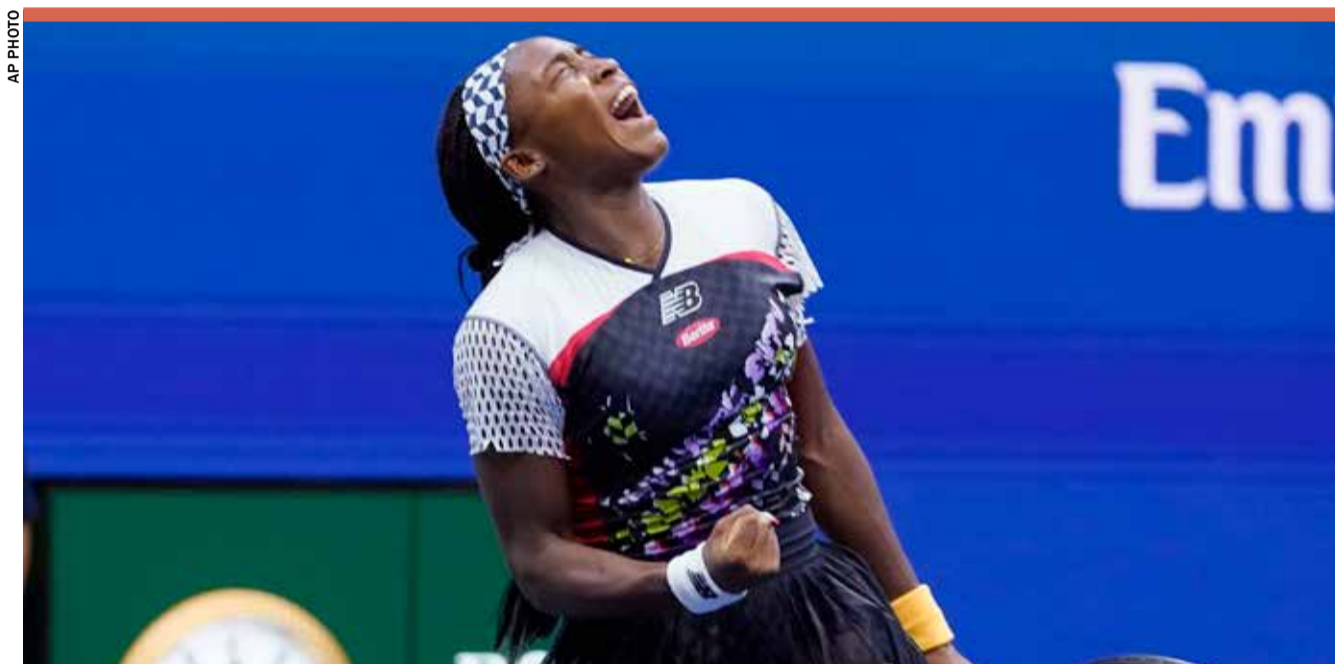
Coco Gauff, of the United States, celebrates after defeating Shuai Zhang, of China

"I'm just glad I'm finally able to show New York my talent," said Kyrgios, never past the third round at the U.S. Open until now. "I haven't had too many great