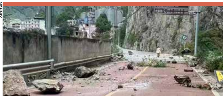
Fallen rocks are seen on a road near Lengqi Town in Luding County of Sichuan Province yesterday

"There was a strong earthquake in June, but it wasn't very