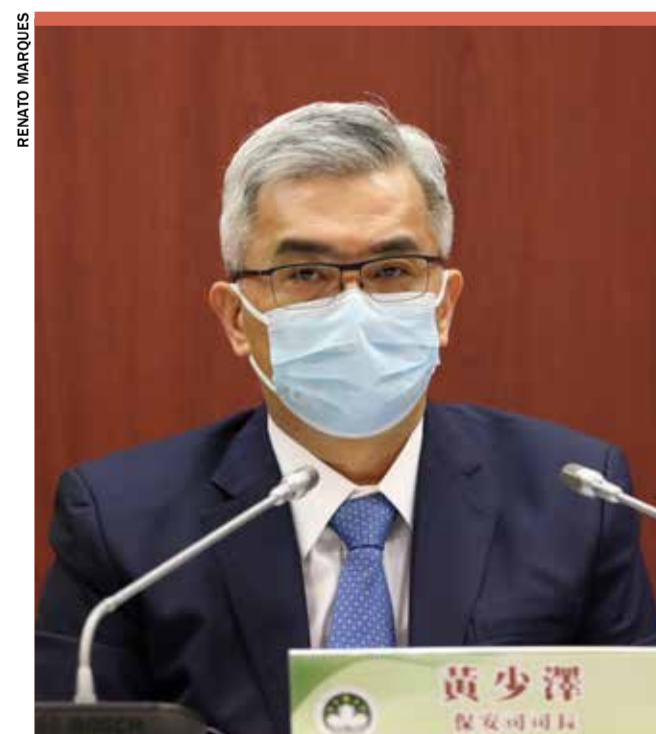
Secretary for Security Wong Sio Chak

The series of public sessions will close with a final open session to be held on Friday (September 16) at 7:30 p.m.