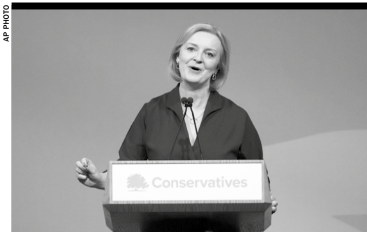
British lawmaker Liz Truss speaks after winning the Conservative Party leadership contest at the Queen Elizabeth II Centre in London

The family lived in Paisley, Scotland, before moving to Leeds in northern England, where Truss attended a public high school — something that