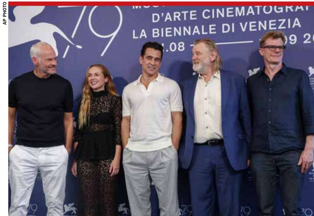
From left: Director Martin McDonagh, Kerry Condon, Colin Farrell, Brendan Gleeson and Graham Broadbent in Venice, yesterday

banned permanently from entering Russia. Previous rounds of Russian sanctions against Americans have included President Joe Biden and members of his family, as well as lawmakers and business leaders. The U.S. has sanctioned numerous Russians, including government officials and business people. Penn and Stiller have been outspoken critics of Russia’s invasion of Ukraine. Penn is an activist involved in relief work, among other causes. Stiller is a goodwill ambassador for the U.N. High Commissioner for Refugees.