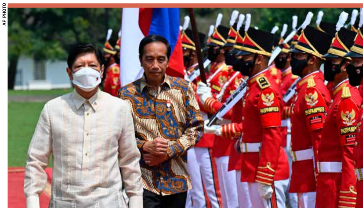
Philippine President Ferdinand Marcos Jr. (left) escorted by Indonesian President Joko Widodo

At a joint news conference, Marcos said increasing the volume of trade between their nations had been important in their talks. He said the strategic partnership between Indonesia and the Philippines, and also with partners, allies and friends around the world, "Will be of critical importance so that we remain stable as we grow out of the pandemic economy."