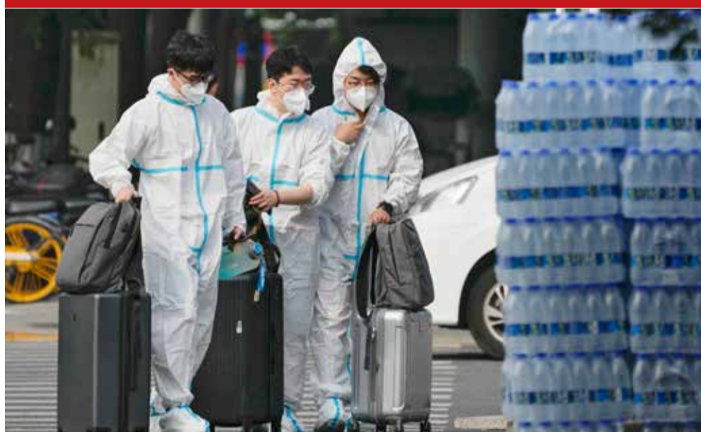
People wearing protective suits with their luggage enter the shuttered Communication University of China in Beijing, Monday