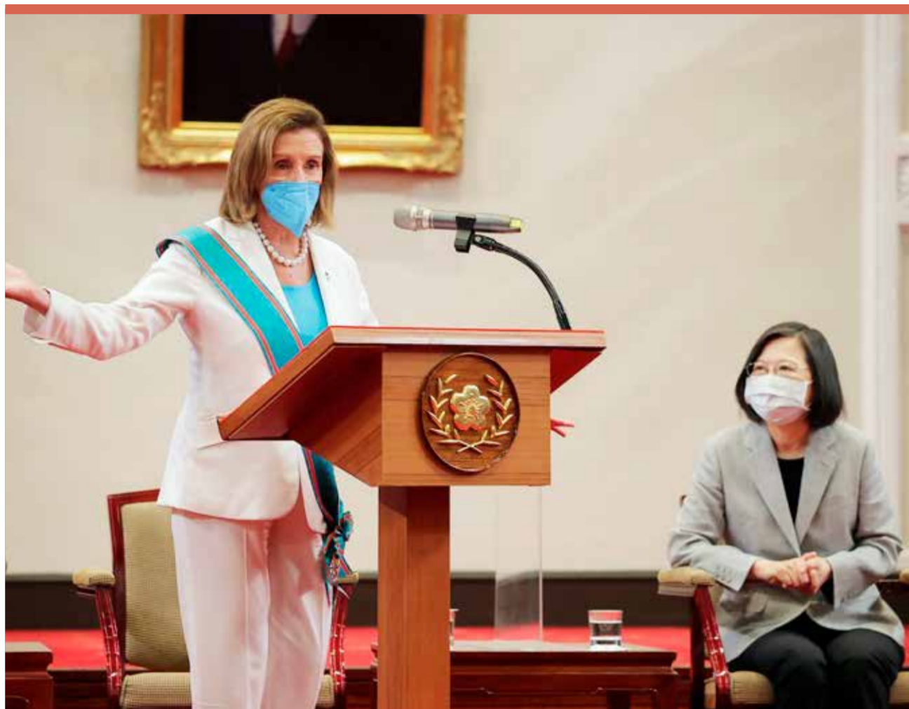
U.S. House Speaker Nancy Pelosi speaks during a meeting with Taiwanese leader Tsai Ing-wen, right, in Taipei, Taiwan, Aug. 3, 2022