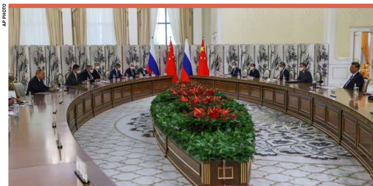
Russian President Vladimir Putin, left, and Chinese President Xi Jinping, right, talk during their meeting on the sidelines of the Shanghai Cooperation Organisation (SCO) summit in Samarkand, Uzbekistan, yesterday

city of Samarkand is part of Xi's first foreign trip since the start of the coronavirus pandemic 2 1/2 years ago, underscoring Beijing's desire to assert itself as a regional power.