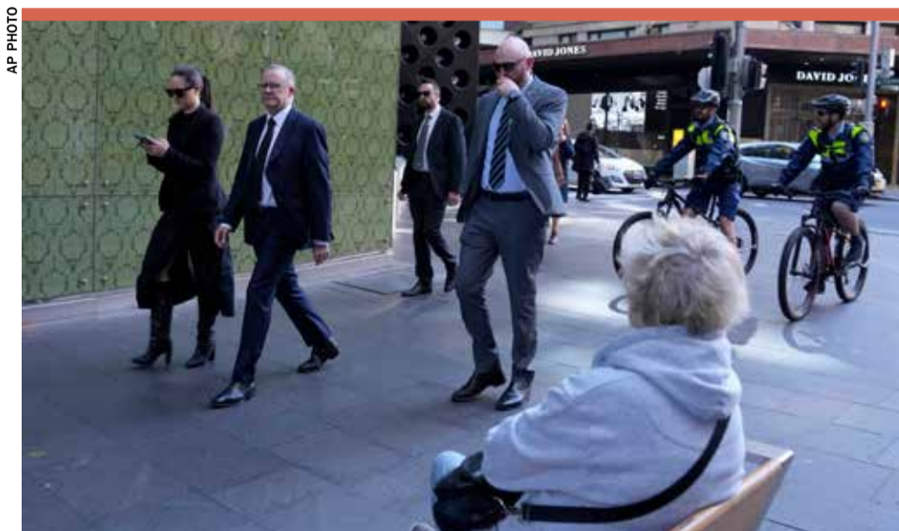
Australian Prime Minister Anthony Albanese, second left, walks in central Sydney after a press briefing, Wednesday

"It's important that the monarchy distance from