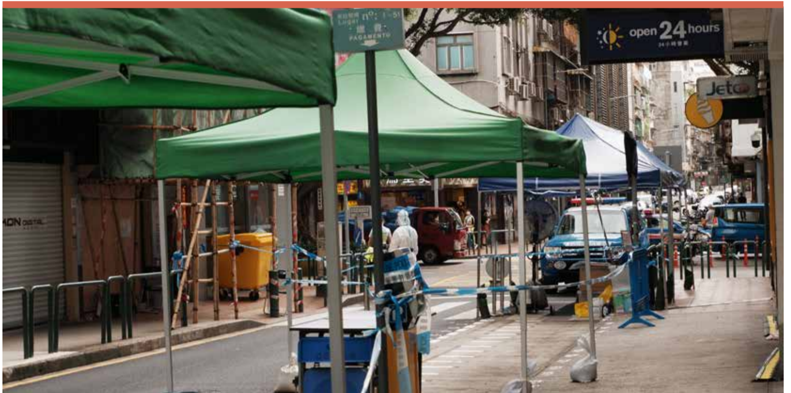
A red code zone in June

end is in sight," the official remarked, based on the figures of the weekly reported deaths caused by the disease, which are the lowest since March 2020.