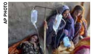
Pakistani engineers and soldiers cleared a key highway yesterday to enable aid workers to speed up supplies to survivors of devastating floods that have left hundreds of thousands homeless and killed 1,508 people, the majority of them women and children. Traffic between the flood-hit city of Quetta, the capital of southwestern Baluchistan province, and the southern Sindh province had been suspended for weeks after floods damaged the key highway.

The government has ordered mass testing and district lockdowns in cities across China in recent weeks, from Sanya on tropical Hainan island to southwest Chengdu, to the northern port city of Dalian. MDT/AP