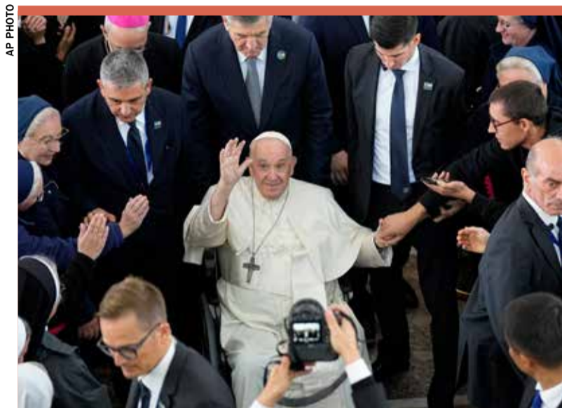
Pope Francis waves at the end of a meeting with priests, religious men and women, seminarians and catechists at the Our Lady Of Perpetual Help Cathedral in Nur-Sultan, Kazakhstan, yesterday

Francis praised the summit and underlined its conclusion that religion can never be used to justify war -- a call that came against the backdrop of the Russian Orthodox Church's support of Moscow's invasion of Ukraine.