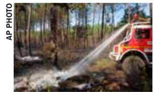
France A major wildfire that ravaged forests in southwestern France stopped spreading yesterday, according to local authorities. The prefecture of the Gironde region said the wildfire has burned more than 37 square kilometers since Monday, leading to the evacuation of 1,840 people. Over 1,000 firefighters, six Canadair aircrafts, three Dash planes and two helicopters have been fighting the flames.