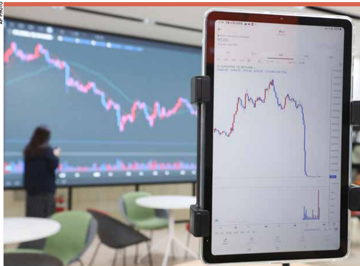
A screen, right, showing the falling values of the Luna is seen at a cryptocurrency exchange in Seoul

Interpol had not publicized the red notice for Kwon on its website as of Tuesday morning, and South Korean prosecutors say