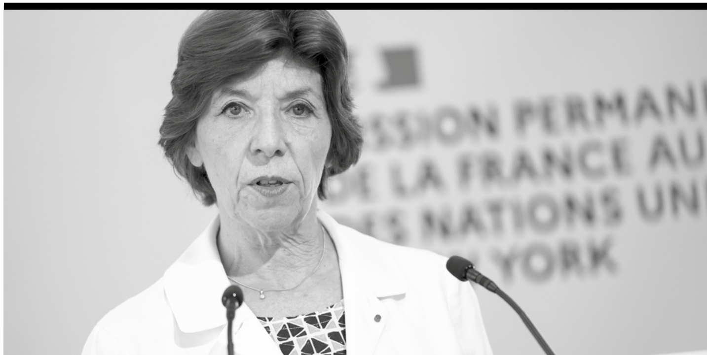
French Foreign Minister Catherine Colonna speaks at a press conference at the French Mission, Monday, in New York