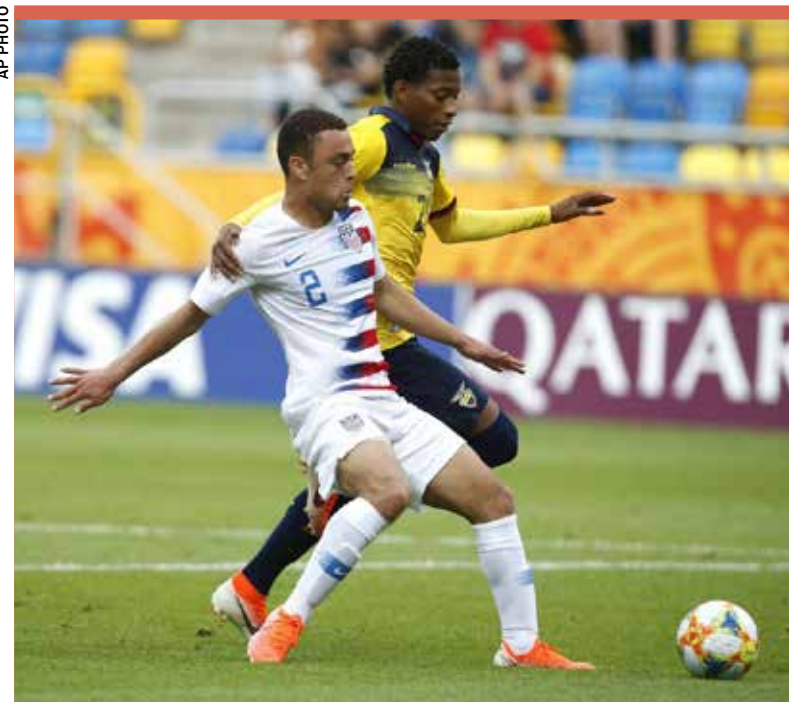
In this June 8, 2019, file photo, United States' Sergiño Dest, left, and Ecuador's Gonzalo Plata challenge for the ball during a quarterfinal soccer match at the U20 World Cup in Gdynia, Poland

Surinamese-American father and Dutch mother and chose to play for the United States instead of the Netherlands, where