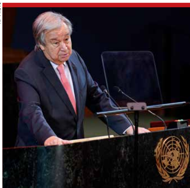
United Nations Secretary-General Antonio Guterres speaks at the start of the Transforming Education Summit at United Nations headquarters, Monday

His opening remarks came as leaders from around the planet reconvened at U.N. headquarters in New York after three years of pandemic interruptions, including an entirely virtual meeting in 2020 and a hybrid one last year. This week, the halls of the Uni-