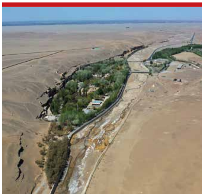
Aerial photo of the Mogao Grottoes in Dunhuang, Gansu Province

In the "initial areas" of the project, construc-