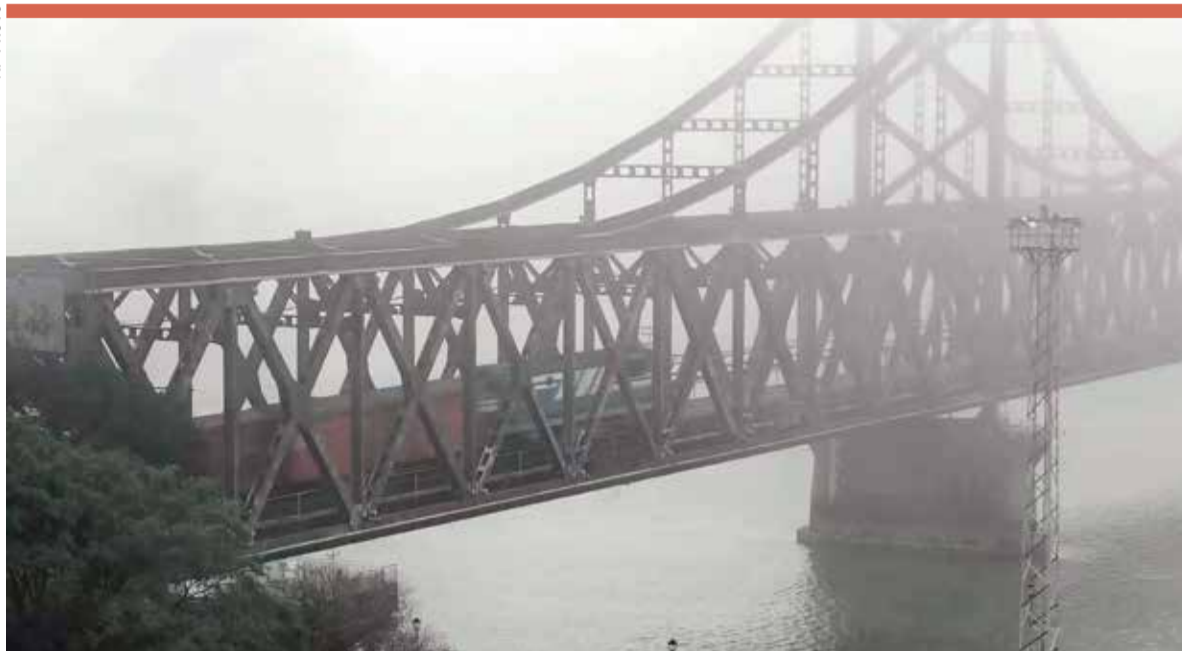
A freight train crosses a bridge connecting China and North Korea in Dandong in Liaoning province yesterday

port between two of their border cities "according to border-related treaties and through friendly consultation." North Korea's state media didn't immediately confirm the reopening.