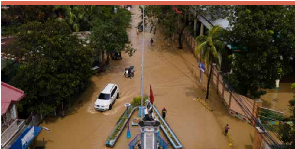
Residents pass by a flooded road from Typhoon Noru in San Miguel town, Bulacan province, yesterday