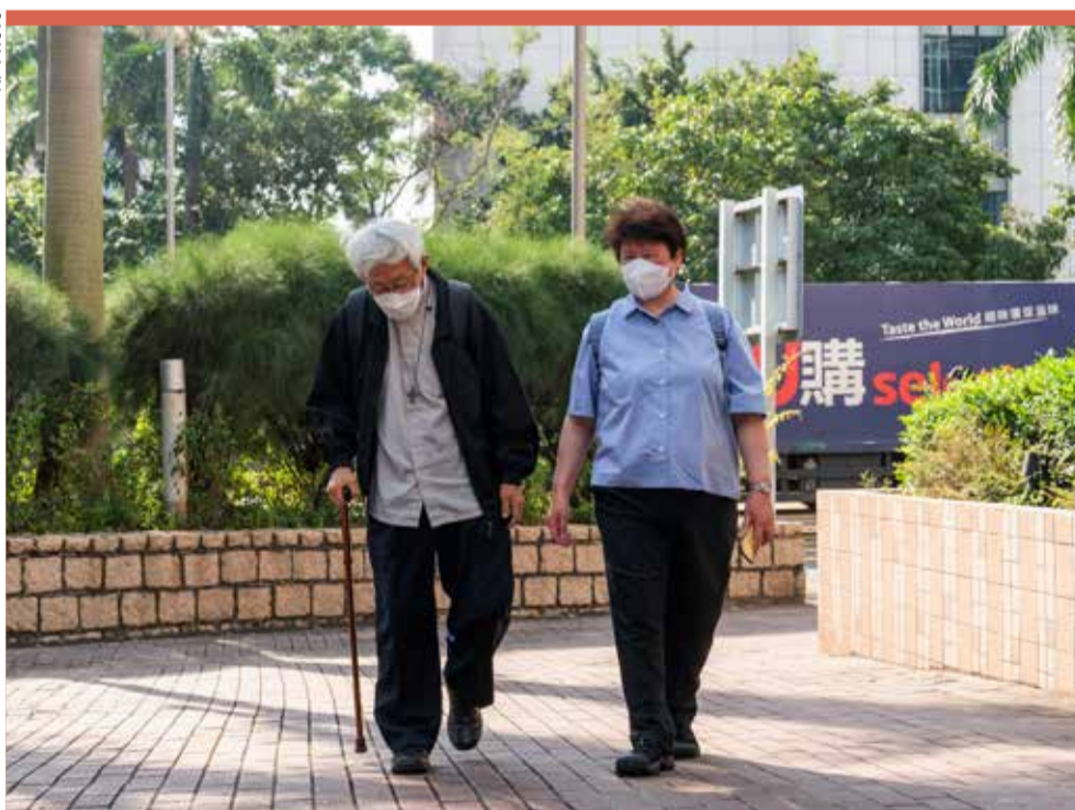
Cardinal Joseph Zen (left) arrives at the West Kowloon Magistrates' courts yesterday