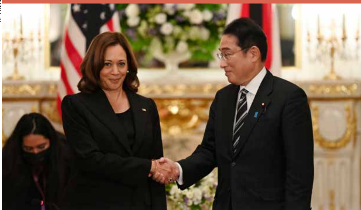
U.S. Vice President Kamala Harris (left) and Japan's Prime Minister Fumio Kishida at the Akasaka Palace state guest house in Tokyo, yesterday

sident Kamala Harris, Vietnamese President Nguyen Xuan Phuc, Philippine Vice President Sara Duterte and about 10 other foreign dignitaries.