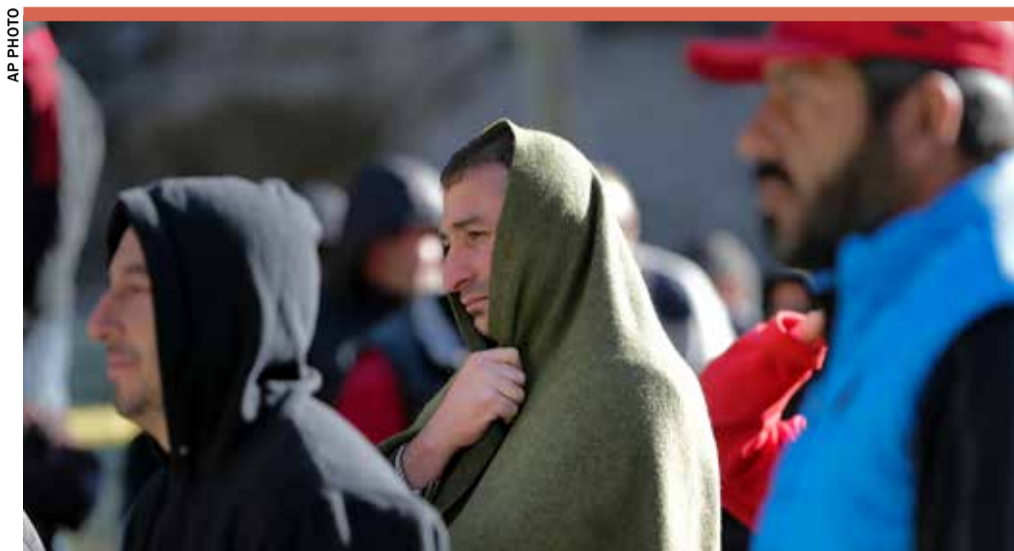
Exodus: Russians lineup after crossing the border at Verkhny Lars between Georgia and Russia yesterday

"Let's imagine that Russia is forced to use the most powerful weapon against the Ukrainian regime that has committed a large-scale act of aggression, which is dangerous for the very existence of our state," Medvedev wrote on his messaging app channel. "I believe that NATO will steer