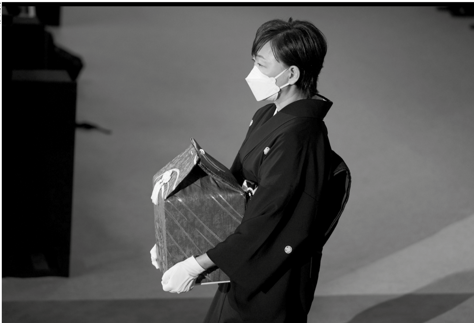
Akie Abe, wife of former Prime Minister Shinzo Abe, carries a cinerary urn containing his ashes at his state funeral yesterday, in Tokyo