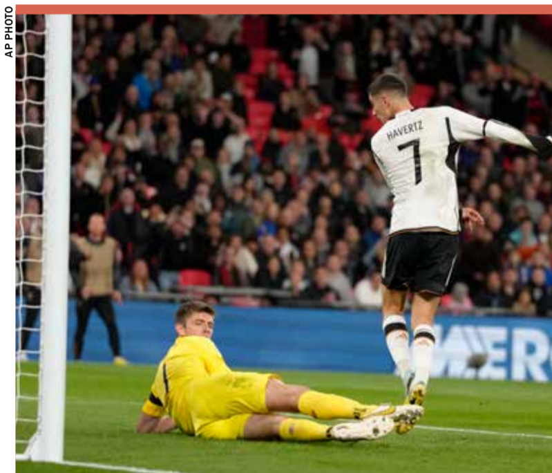
Germany's Kai Havertz scores his side's third goal in dramatic 6-goal draw

Unlike Italy, England and Germany will be going to the World Cup in Qatar in less than two months and they'll head to the Middle East on the back of a wild 3-3 draw at Wembley Stadium, where all the goals were scored in