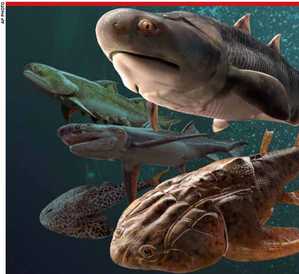
This illustration provided by Heming Zhang in September 2022 depicts some of the fossil fish, more than 400 million years old, which were found by researchers in southern China