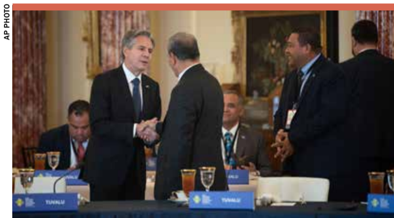
U.S. Secretary of State Antony Blinken (left) greets dignitaries from Pacific Island Countries in Washington

The president's push to improve relations in Pacific comes amid growing U.S. concern about China's growing military and economic influence. Earlier this year, the Solomon Islands signed a new