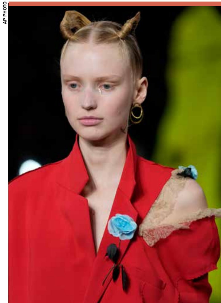
A model wears a creation for Undercover ready-to-wear Spring/Summer 2023 fashion collection

One unique bustier was created with the bark from chestnut trees, while looks in basketweave were fashioned from materials out of bogs and meadows, all softened in water for an ethnic look.