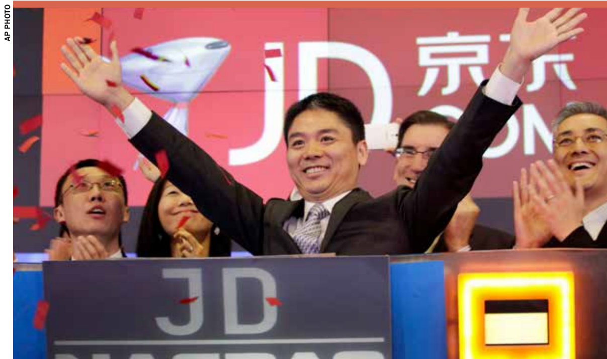
Liu Qiangdong, also known as Richard Liu, CEO of JD.com, raises his arms to celebrate the IPO for his company at the Nasdaq MarketSite, in New York on May 22, 2014