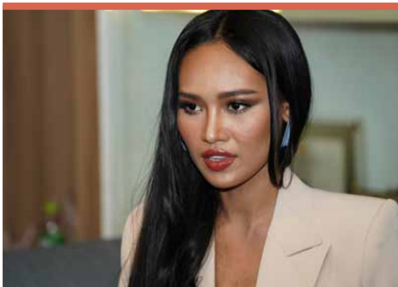
Burmese fashion model Thaw Nandar Aung, also known as Han Lay, speaking to a reporter in Bangkok, last year

Tuesday that she was headed to Canada, after having been granted political asylum there with the assistance of the U.N. refugee agency and the Canadian Embassy in Thailand.