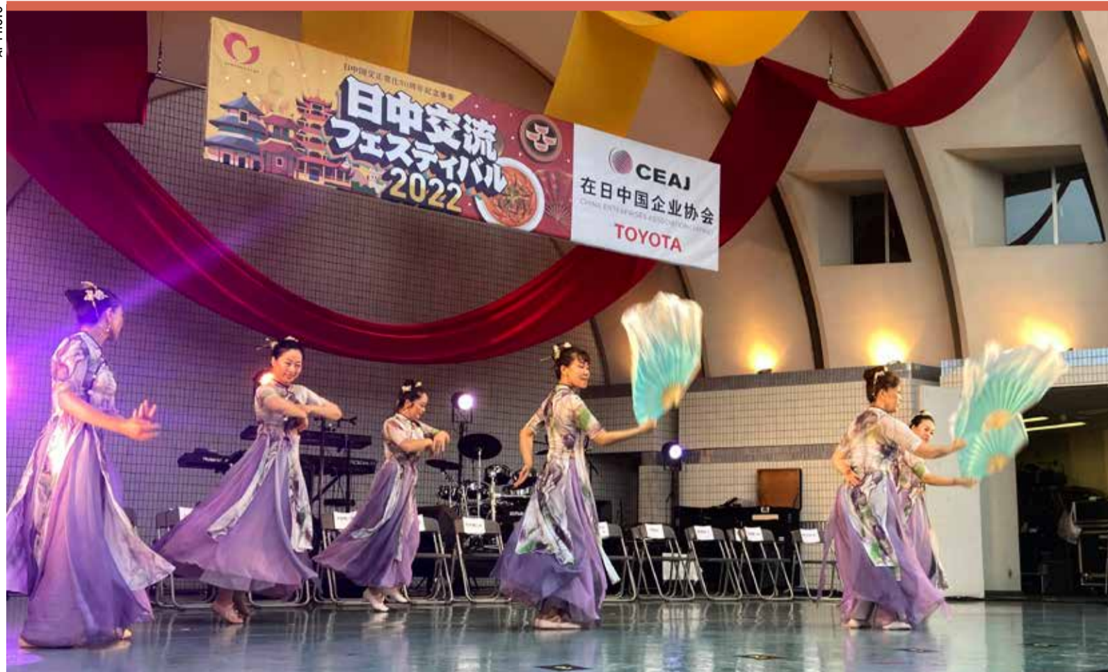
Dancers perform at the annual Japan-China Exchange Festival at the Yoyogi Park in Tokyo on Saturday, in the celebrations of the 50th anniversary of the normalization of the bilateral relations